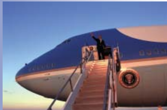
President George W. Bush waves from Air Force One as he departs Ellington Field, Houston.