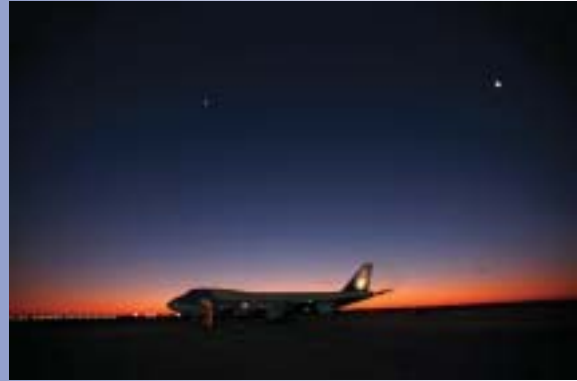
Air Force One is pictured on the tarmac as the sun rises at Andrews Air Force Base.

Air Force One, now a 747, used first by President George H. W. Bush in 1990, will usher Presidential travel into the 21st century, and continue to represent the United States around the world.