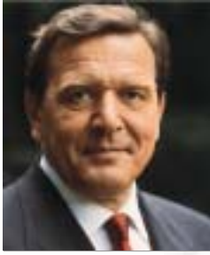
His Excellency Gerhard Schröder

Chancellor of the Federal Republic of Germany