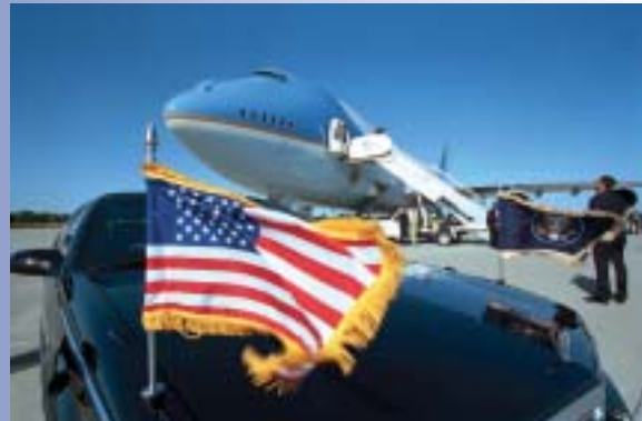
The American Flag waves on the Presidential Limousine as Air Force One is pictured in the background.