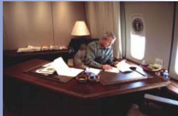
President George W. Bush works at his desk in his office aboard Air Force One during a flight to Medford, Ore.