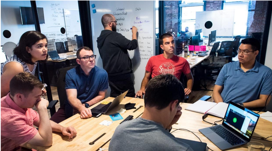
Photo: A software development team conducts an Iteration Planning Meeting about a software project in the office of Kessel Run. Photo credit: U.S. Air Force photo by J.M. Eddins Jr. Attribution-NonCommercial 2.0 Generic (CC BY-NC 2.0) Photo link . License link . Disclaimer: The authors of this article are not responsible for and do not endorse any content found on flickr.com or creativecommons.org. No changes made.

Those IC elements that struggle with software development are encouraged to seek out partnerships with the private sector to absorb best practices. While Kessel Run’s model may not be a perfect match, IC elements should seek to adopt the best practices of DevSecOps in appropriate ways. Good software also requires good infrastructure. While the IC is a government leader in areas like cloud computing, it still faces challenges migrating legacy systems and data to the cloud, and continued work is necessary. 80