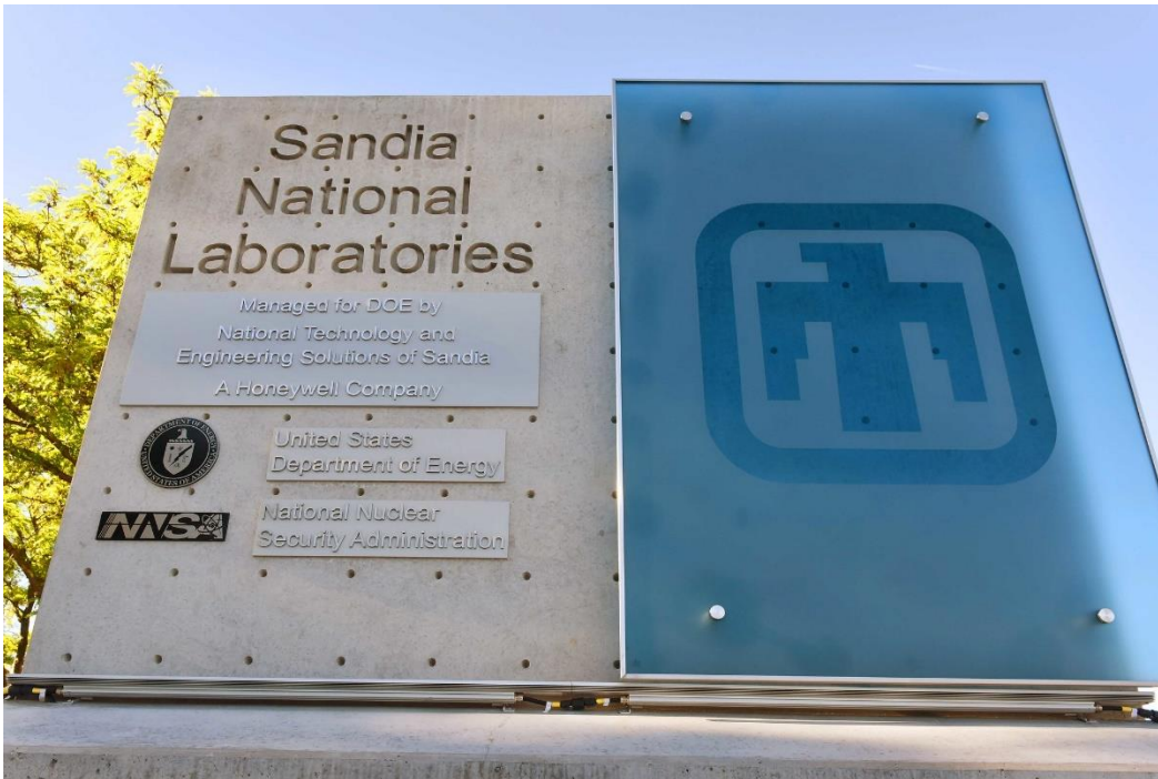
Attribution-NonCommercial-NoDerivs 2.0 Generic (CC BY-NC-ND 2.0) Photo link. License. Disclaimer: The authors of this article are not responsible for and do not endorse any content found on flickr.com or creativecommons.org. No changes made.

For example, while DOE’s Office Intelligence and Counterintelligence (“DOE-IN”) plays a centralizing function between the DOE National Laboratories and sponsoring elements from the IC, its responsibilities are, as a matter of staffing and practice, largely constrained to administrative processing of project submissions. The Subcommittee sees an opportunity for DOE-IN or another appropriate body to adopt a more assertive role in strategic coordination, deconfliction, administrative processing, and even technical advisement, to improve the alignment of IC needs with National Laboratory capabilities.