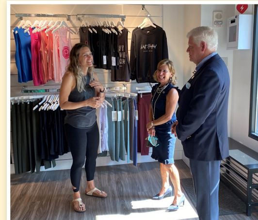
Speaking with a small-business owner in West Hartford.