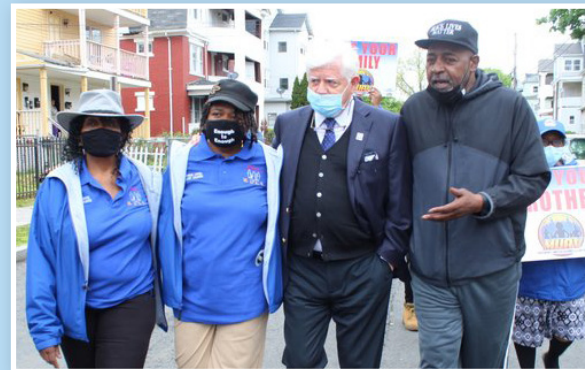
Listening and learning from community leaders in North Hartford.

“$1.25 trillion infrastructure package approved by Congress will fix some of Connecticut’s biggest transportation headaches.”