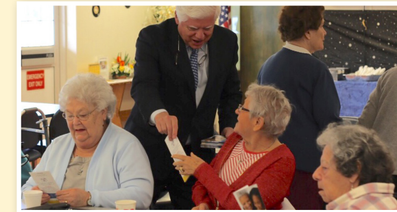
Visiting seniors at the Windsor Senior Center.