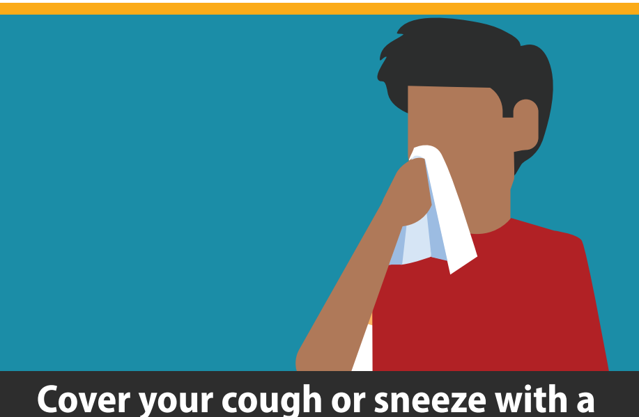
Cover your cough or sneeze with a tissue, then throw the tissue in the trash and wash your hands.

Stay at least 6 feet (about 2 arm lengths) from other people.