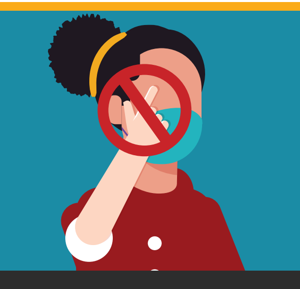
Do not touch your eyes, nose, and mouth.