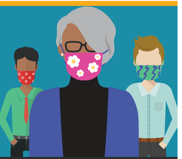
When in public, wear a mask over your nose and mouth.