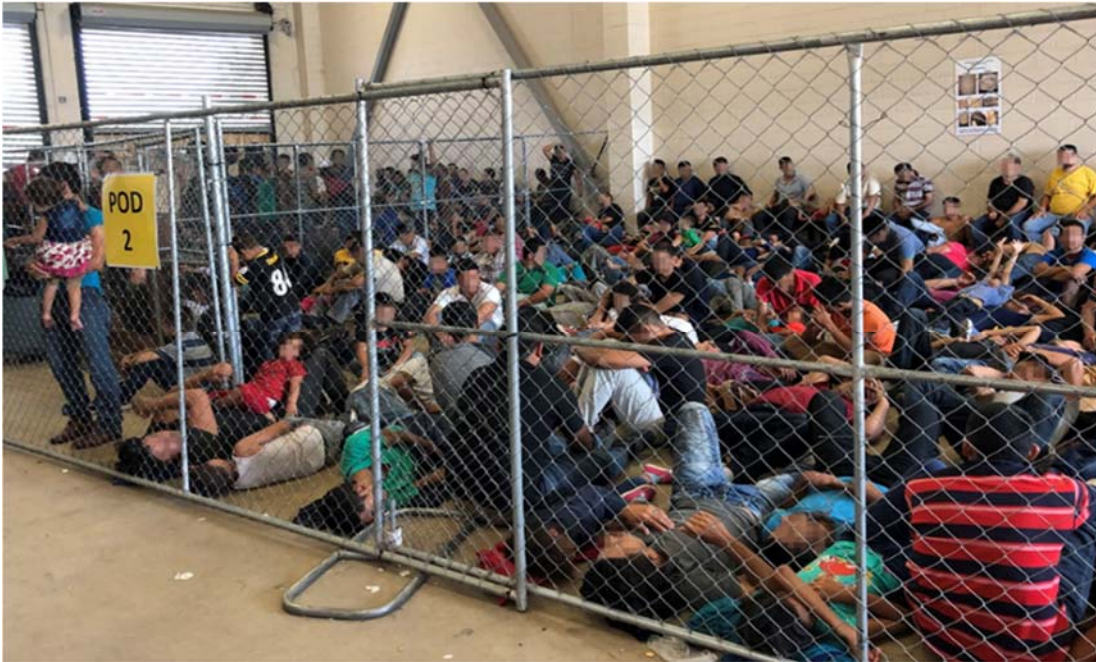
Figure 1. Overcrowding of families observed by OIG on June 10, 2019, at Border Patrol's McAllen, TX, Station.