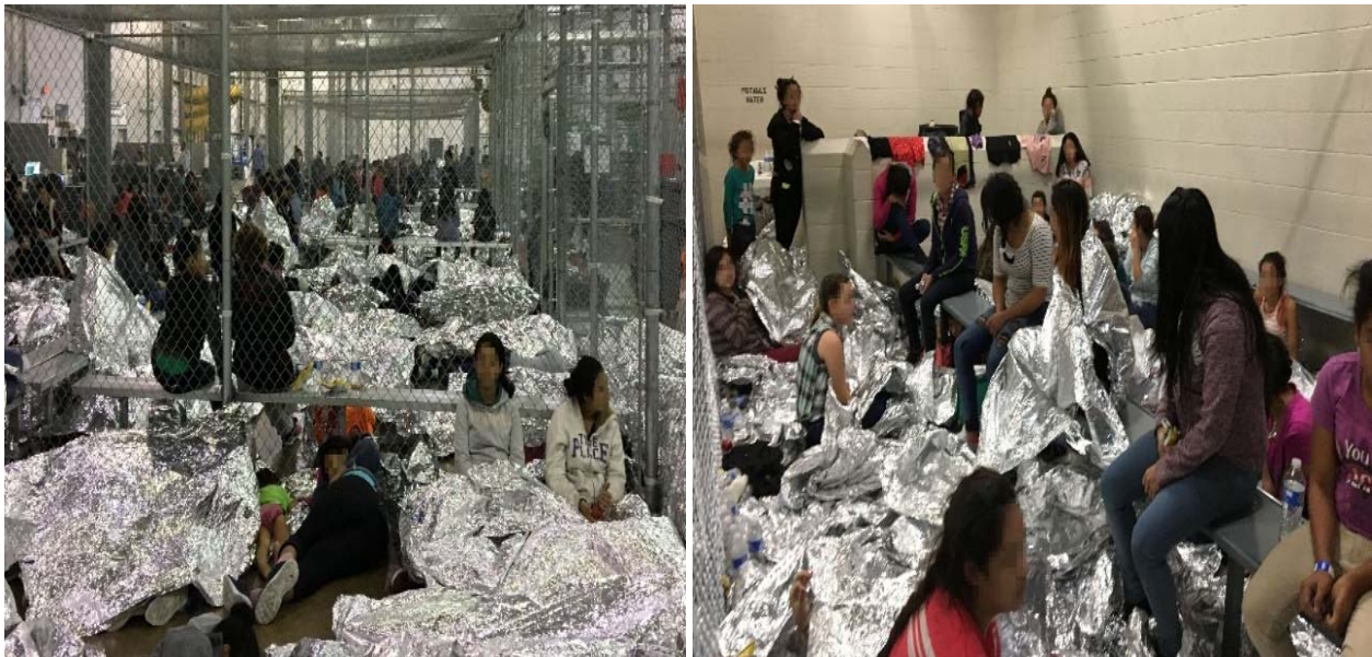
Figure 2. Overcrowding of families observed by OIG on June 11, 2019, at Border Patrol's McAllen, TX, Centralized Processing Center.