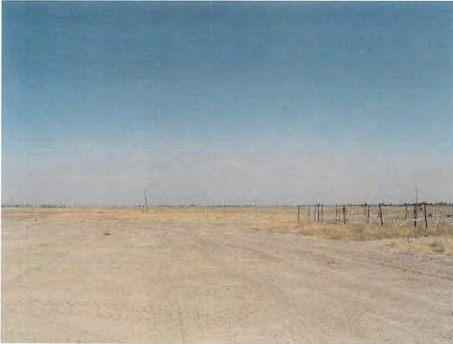
Figure 6. View West of the US Military Communication Site (located South of runway)