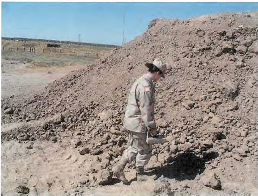
Figure 9. Radiation monitoring on newly constructed berms at K2 Airbase ASP