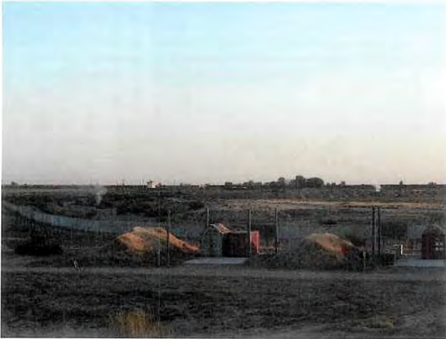
Figure 2. Open pit trash fire burning South of K2 Airbase ASP (021000DSEP04)