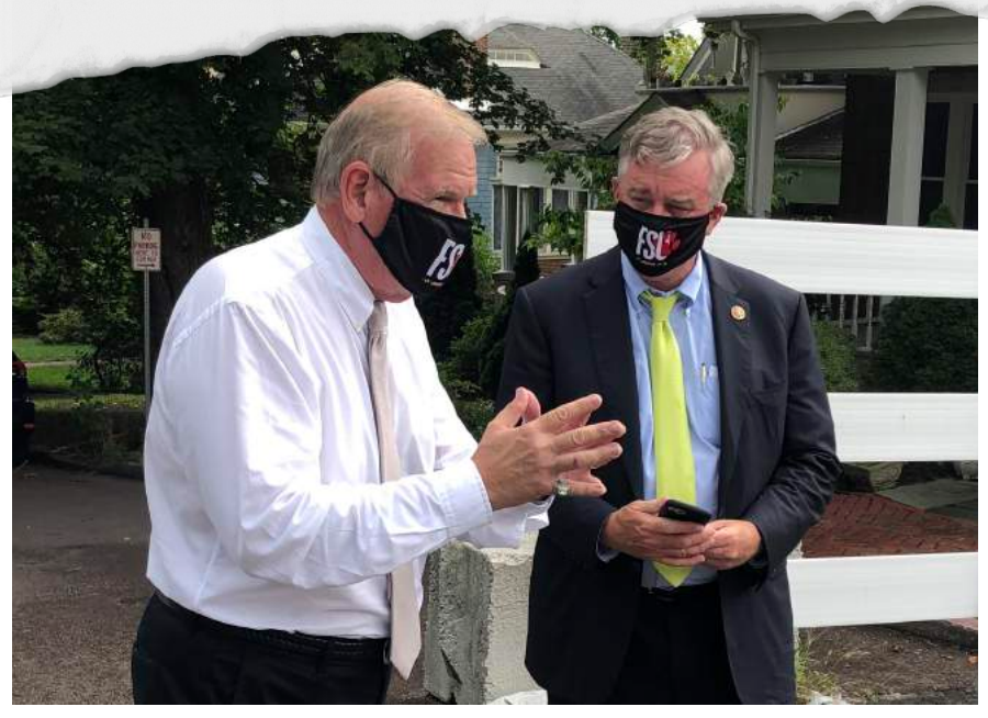
Congressman Trone discusses the need for infrastructure funding for Western Maryland with Cumberland Mayor Ray Morriss.

THE GARRETT COUNTY REPUBLICAN | 5/20/2020