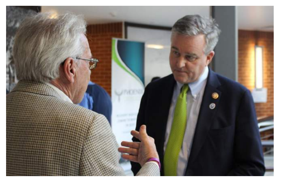
Congressman Trone speaks with a constituent at an addiction event in 2019.