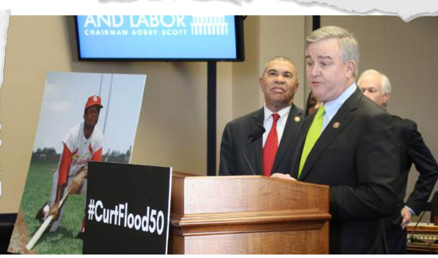
Congressman Trone hosts a press conference to induct baseball legend Curt Flood into MLB Hall of Fame in February 2020.