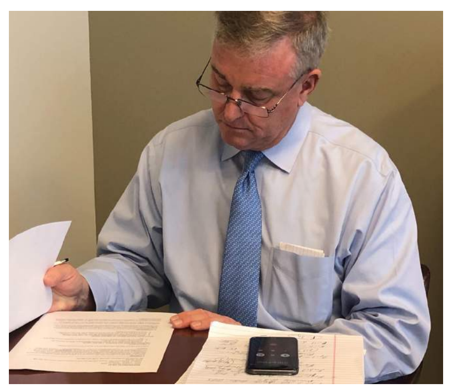
Congressman Trone hosts telephone town hall with thousands of constituents impacted by the COVID-19 pandemic.