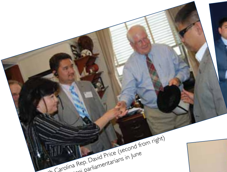
North Carolina Rep. David Price (second from right) greets Kyrgyzstani parliamentarians in June

In 2011, Open World delegations had nearly 200 meetings with Members of Congress and congressional aides. These sessions allowed our Eurasian participants to see congressional office operations and constituent relations in action, to gain federal legislative perspectives on the themes of their exchanges, and to share information about their work and their countries with leaders in Congress. A number of these meetings are featured here.