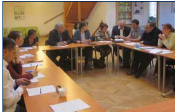
A 2012 Open World–sponsored roundtable in Tbilisi discusses social inclusivity, with alumni of the 2011 Jacksonville exchange as featured speakers.