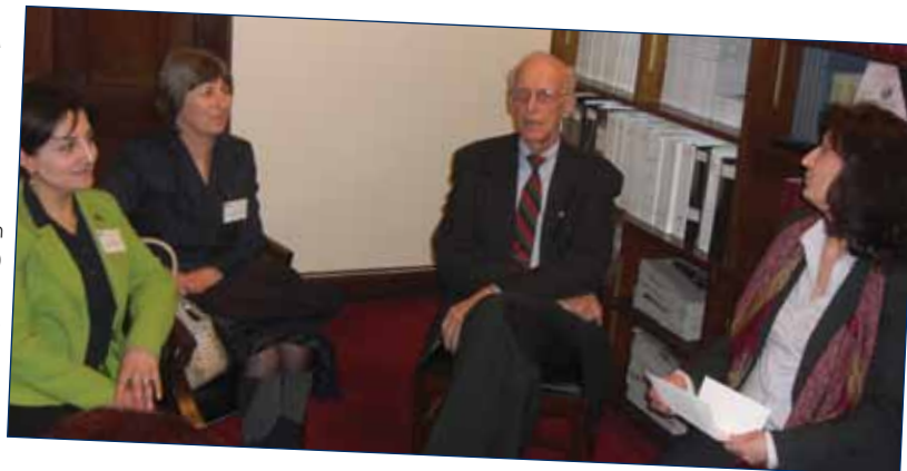
Massachusetts Rep. John Olver (second from right) meets with Georgian educators in March.