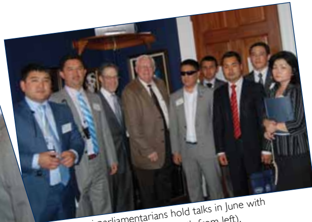
Kyrgyzstani parliamentarians hold talks in June with Pennsylvania Rep. Joe Pitts (fourth from left).