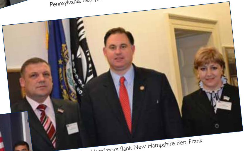
Moldovan regional legislators flank New Hampshire Rep. Frank Guinta (March).