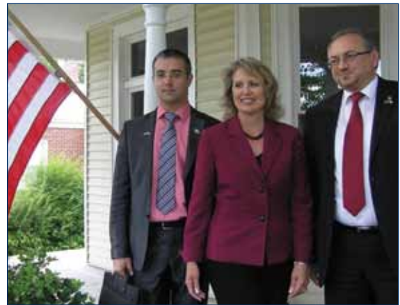
North Carolina Rep. Renee Ellmers (center) at her Dunn district office with two Moldovan parliamentarians whom she hosted for Open World in May.