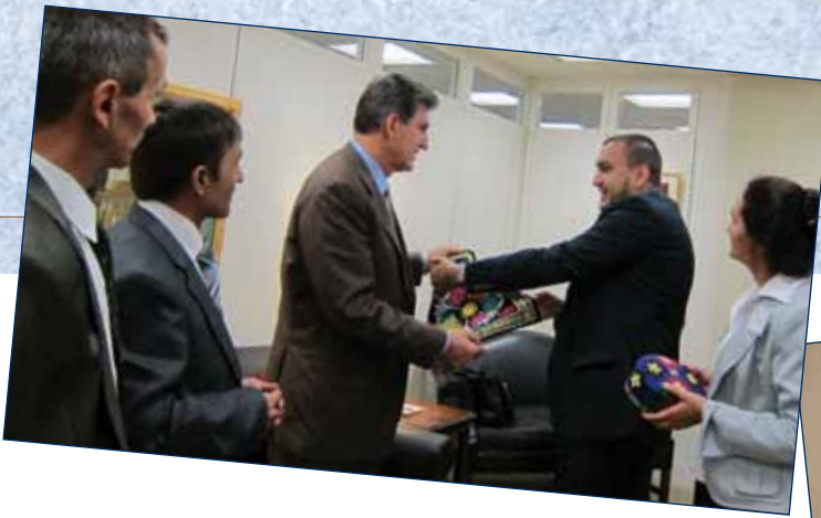
Tajikistani local officials speak with West Virginia Sen. Joe Manchin (center) in May.