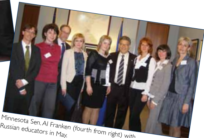
Minnesota Sen. Al Franken (fourth from right) with Russian educators in May.