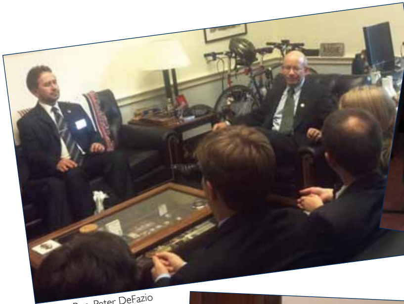
Oregon Rep. Peter DeFazio (upper right) visits with Ukrainian university educators in October.