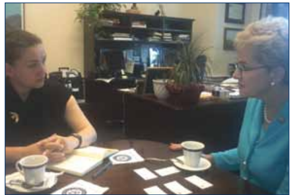
Ukrainian parliamentarian Olesia Orobets (left) and Rep. Marcy Kaptur (OH) meet in September in Washington, DC.