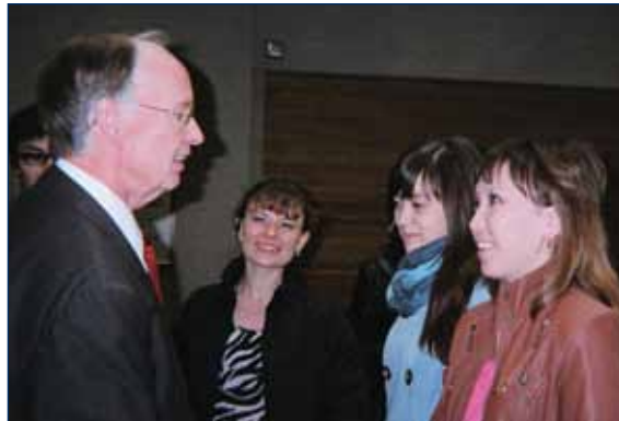
Alabama Gov. Robert Bentley (far left) greets Kazakhstani Open World participants in Montgomery.