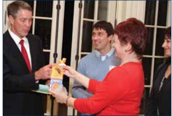
Russian health leaders present a memento to one of the main hosts of their Tennessee exchange, former Sen. Bill Frist (far left), a past Open World trustee.

Grantees: Friendship Force International, Nashville Health Care Council