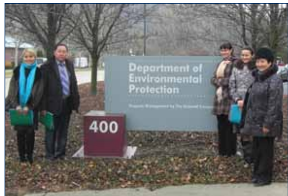
Kazakhstani delegates visit the Pennsylvania Department of Environmental Protection in late February.