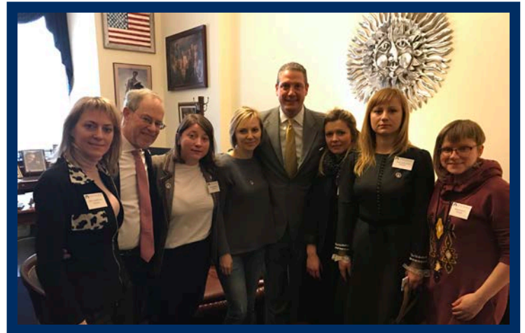
Delegates from Ukraine meet with Rep. Tim Ryan in his D.C. office (March 2017)

An all-women delegation from Ukraine traveled to Akron to discuss the issues facing internally displaced people from the Crimean Peninsula. Before heading to Akron, the delegates visited the D.C. office of Rep. Tim Ryan . A meeting with the International Institute of Akron allowed the delegates to learn about the services available to refugees and immigrants in the U.S. A highlight of the visit was observing a city council meeting.