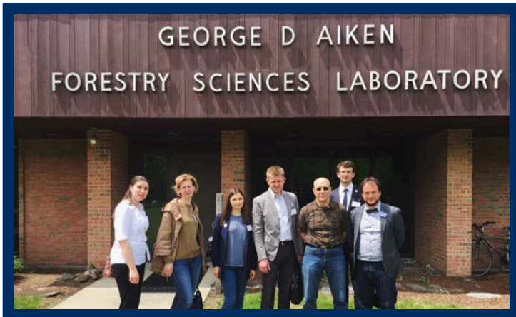
Russian delegation visiting the George D Aiken Forestry Sciences Library (May 2017)