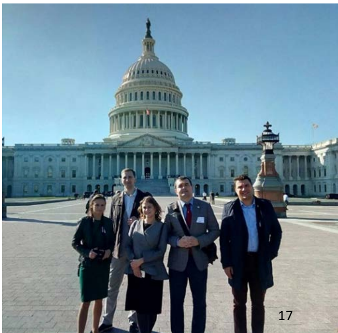
Intellectual Property Rights professionals from Belarus walk to congressional meetings prior to their departure for New Haven, CT hosted by Rotary of New Haven. (October 2017)

Exemplifying the success of this program, those who interacted with the Belarus Intellectual Property Rights delegation remarked on their professionalism and dedication to the subject and its enforcement. A meeting with the Department of Justice's Computer Crime and Intellectual Property Section resulted in an important discussion about international enforcement and key areas of cooperation to preserve evidence and prevent intellectual property crimes. In addition to an exemplary program that allowed the Belarus delegation to discuss important enforcement and other issues surrounding new and emerging technologies, the cultural program and home stay experience gave the participants a greater understanding and appreciation for "real" America.