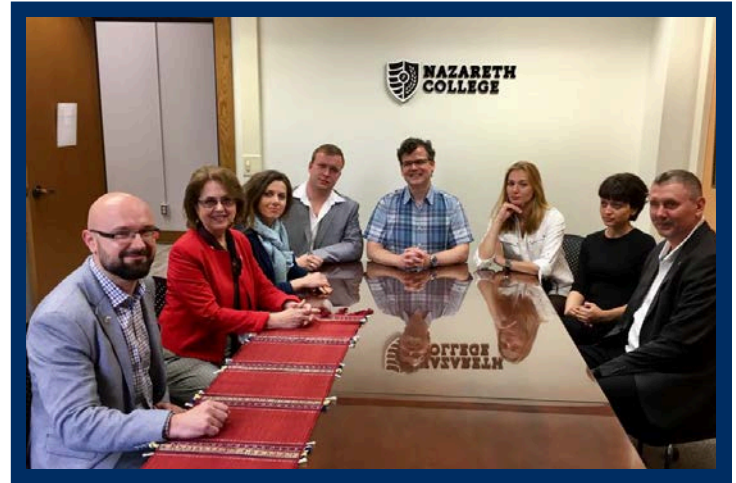
Delegates from Ukraine visit Nazareth College in Rochester (May 2017)

A delegation Georgia was hosted in Syracuse to develop a greater understanding of Media Practices and Independent Media production. The delegation was able to attend meetings with a number of meetings with professionals and educators. While visiting the WCNY Public Radio and Television, the Georgian delegation was able to learn about the methods one of the most well-known local stations connect their viewers to education and the arts.