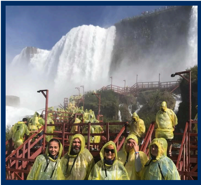
Delegates from Georgia stand at the base of Niagara Falls in during an excursion to Buffalo, NY (September 2017)