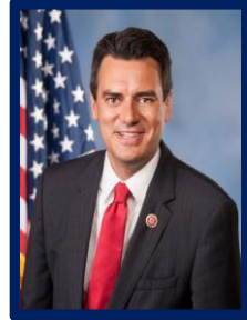
Hon. Kevin Yoder Chairman, House Appropriations Subcommittee on Legislative Branch