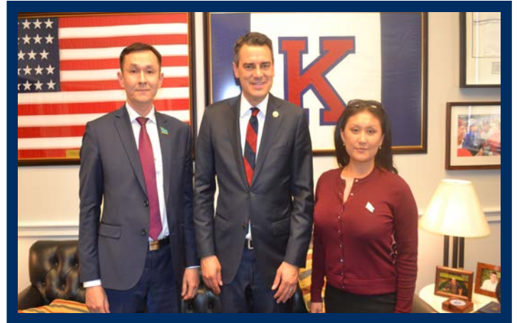
Members of Parliament from Kazakhstan meet with Rep. Kevin Yoder in his D.C. office (April 2017)