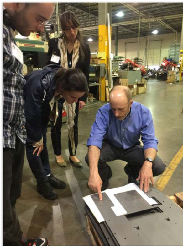
Georgian entrepreneurs visit the Cherokee Office of Economic Development in Woodstock, GA to look at entrepreneurship initiatives. (March 2017)