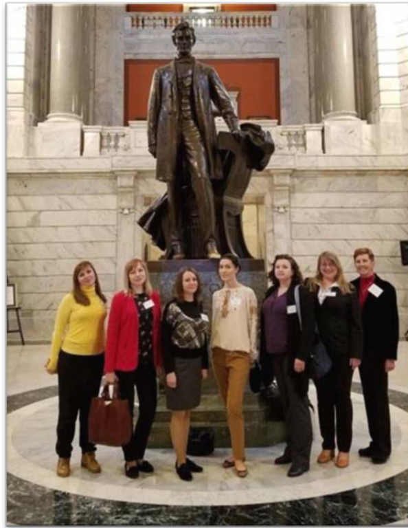
Delegates from Ukraine visit the State House in Louisville, KY while participating on a program focusing on Combatting Human Trafficking (March 2017)

Finally, in the business and partnership field, one Open World alumnus returned to Birmingham in 2017 with a delegation led by the Mayor of Vinnitsa to launch an innovative mobile platform for peer to peer car sharing with his new partner from Birmingham. During this visit, Open World's alumnus registered this company in the United States and it can be found at www.sizecar.com .