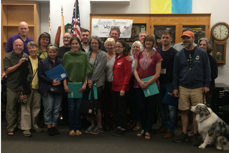
Sebastopol World Friends hosts and their Ukrainian guests

A seven-member delegation of Ukrainians arrived in Sebastopol on Sept. 23 and will stay in the area two weeks through a congressionally sponsored Open World cultural exchange program.