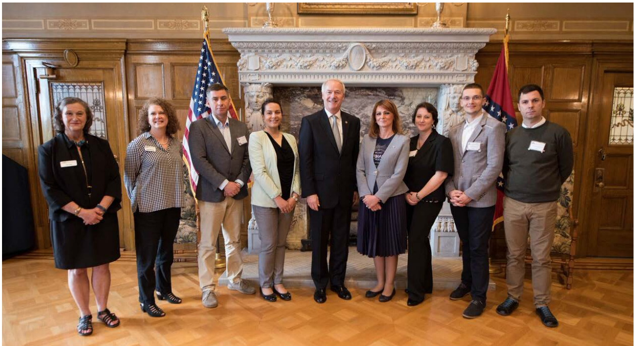
Delegates from Serbia meet with Governor of Arkansas Asa Hutchinson during their program in Little Rock. The delegation was focusing on Food Security and Food Safety (May 2017)

Inspired by her U.S. experience, the judge gathered together a first responder team, where each member explained their area of activity and legal tools to help the victims, with a special attention being paid to updates in the new law. Starting with an NGO sector representative, through police and social services, the panelists gave an introduction on the general forms of domestic violence, how it develops and escalates, and what are the mechanisms to react to it as a victim or as a citizen witnessing it. They explained how the system is helping the victims and their families. The panel continued with presentations by the public prosecutor and a judge, who described where significant changes will take place that provide better protection to the victims.