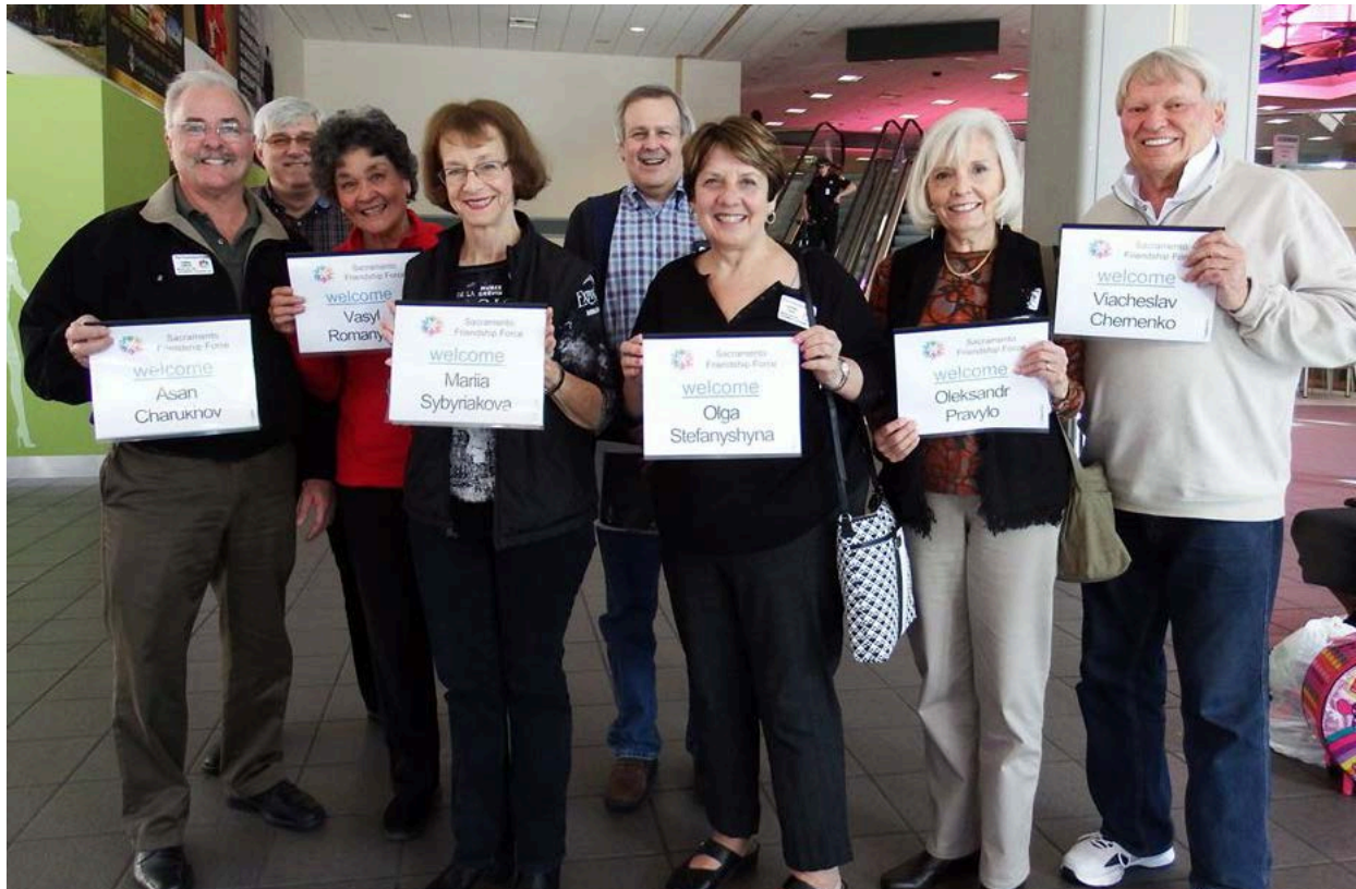
Local hosts in Sacramento, CA eagerly wait for a delegation of legislative staffers and health professionals from Ukraine. (February 2017)