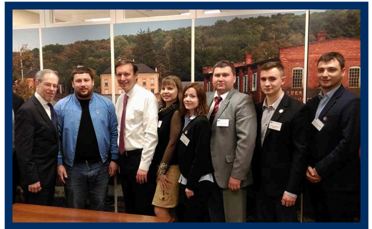
Delegates from Ukraine meet with Sen. Chris Murphy (April 2017)

A delegation of Rumsfeld Fellows from various countries visited Hartford in late April. While there, the delegation visited several historical sites and multiple presentations at institutions. The delegates went on the Mystic Seaport Tour, visited the Nautilus and US Navy Submarine Force Museum, toured the Thomas Hooker Brewery, and went inside the Connecticut Department of Consumer Protection. The delegation also attended presentations at the Entrepreneurial Center at the University of Hartford Butterworth Hall. The delegation also had lunch with the West Hartford Chamber of Commerce.