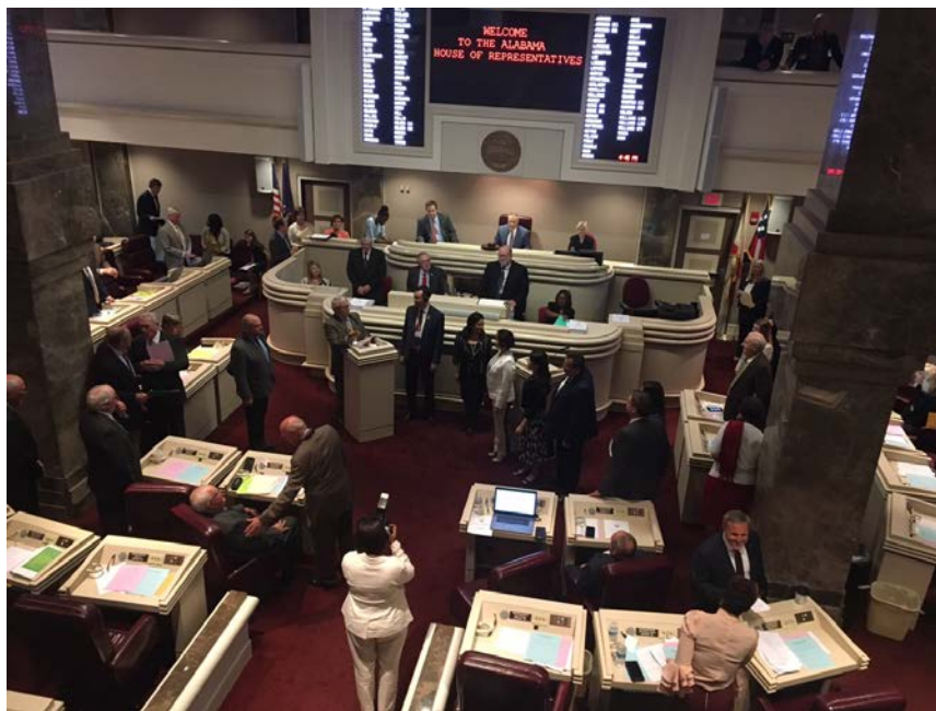
Members of the Parliament of Kazakhstan on the floor of the Alabama House in Montgomery. (April 2017)

From 2008 through 2017, the Center hosted 471 delegates from Kazakhstan. This year we will host 18 delegates focused on the themes of parliamentarians, support for small and medium enterprises, and prison reform. Open World has introduced many young Kazakh leaders to their professional counterparts in scientific, legislative, academic, and innovative industries to facilitate the development of cross-cultural communication, citizen diplomacy, and economic development. Illustrative of this is the strong sister city relationship between the Kazakh city of Pavlodar and Mauston, WI with a wide range of entrepreneurial follow-up projects and privately funded reverse travel.