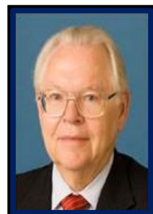
Hon. James F. Collins Carnegie Endowment for International Peace