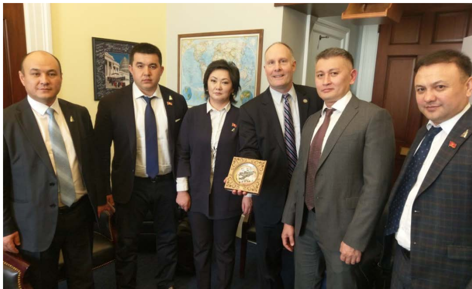
Members of the Parliament of Kyrgyzstan meet with Rep. John Moolenaar (MI). (February 2017)

The program's third session was led by a coach of positive thinking and motivation, who is a graduate of American University in Central Asia and a successful hotelier and restaurateur. During her presentation on "The Magic Keys of Your Future," this Open World alumna talked about the importance of positive thinking and of drawing up a wish list, shared examples from her life and advised attendees on useful literature to read. In the afternoon, the participants met with a young businessman, an Open World alumnus, who shared how he started his business, his successful and unsuccessful projects, and his new plans and ideas.