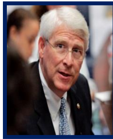
Hon. Roger Wicker United States Senate