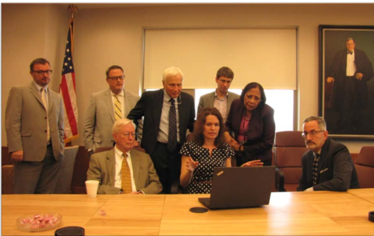
Estonian judges meet a group of magistrate and bankruptcy judges in Jackson, MS. (April 2017)

Estonia's 2017 judicial delegation reported that "Our visit provided participants with ideas concerning what is better in the U.S. legal system. At the same time it provided insight into what is already good in our system and should not be changed."