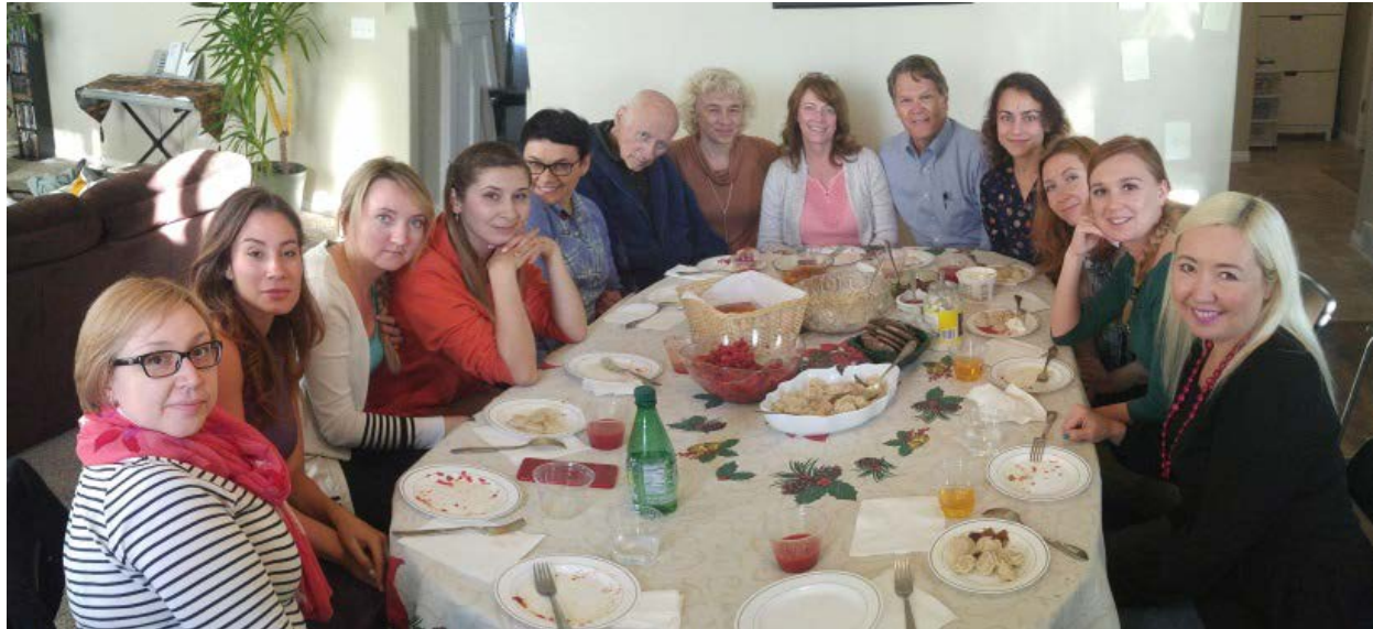
The Tooele Sister City Committee in Utah hosted a Russian delegation of mental health professionals traveling on the theme focused on Autism Spectrum Disorder. (September 2017)

country and a roster of some 70 dependable Open World facilitators covering about 20 regions. Former U.S. Ambassador to the Russian Federation (2014-2017), and to Georgia (2005-2009) and Ukraine (2009-2013), John Tefft indicated that he had personally seen firsthand how Open World alumni play a critical role in helping improve ties between our countries. We are excited to provide newly appointed Ambassador to Russia Jon Huntsman our insight as to the country and where accessible and open-minded Russians would be located.