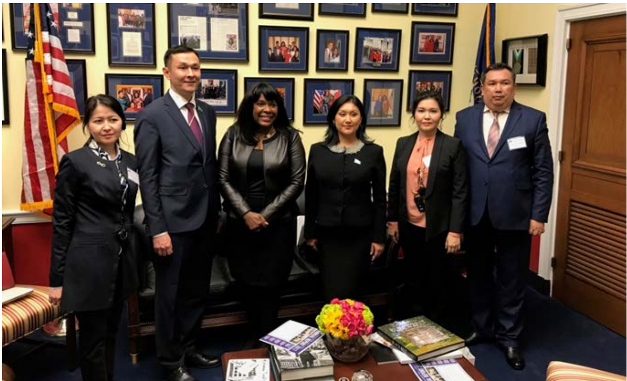
Kazakh Members of Parliament and parliamentary staff meet Rep. Terri Sewell (AL-07) in her Capitol Hill office in Washington, D.C. prior to their travels to Birmingham, AL. (April 2017)

One profound insight the delegates derive from their experience in the United States is that elected officials are accountable to their constituencies. Another powerful element of the program is the impact of home stays – Open World delegates live with American families while in the United States. Partnerships and deeper understanding forged between American hosts and the delegates multiply the connections within and among their communities with profound results.