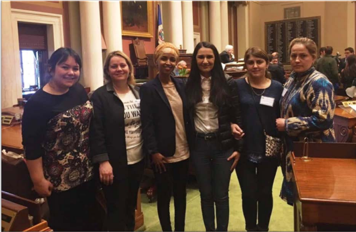
Delegates from Tajikistan, a predominantly Muslim country, working to combat violent extremism meet with the first U.S. legislator from Somali, Ilhan Omar, at the Minnesota state legislature. (March 2017)