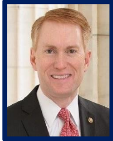
Hon. James Lankford Chairman, Senate Appropriations Subcommittee on Legislative Branch