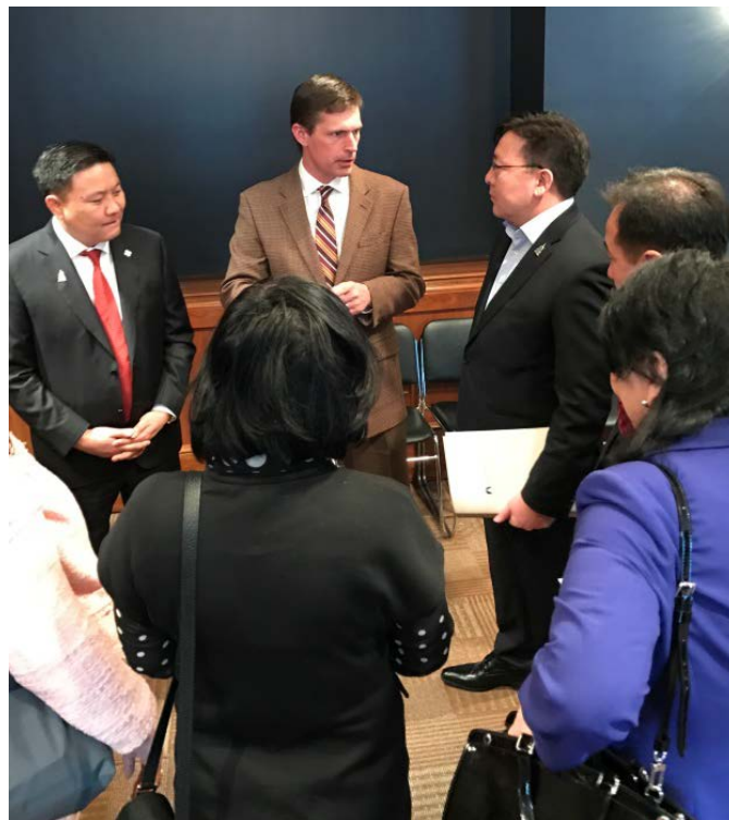
Members of Parliament from Mongolia meet with Senator Martin Heinrich (NM) in Washington, D.C. (March 2017)