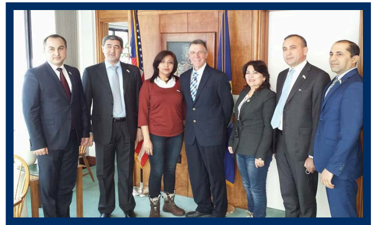
Members of Parliament from Tajikistan meet with Governor of Vermont Phil Scott (February 2017)

Delegates from Russia , focusing on the use of DNA Analysis to Deter Illegal Logging, visited the U.S. Forest Service Northern Research Center to learn about its leading-edge forest science and technology applications. The delegates enjoyed a visit to the district office of Senator Patrick Leahy , since he serves on the Conservation, Forestry, and Natural Resources Subcommittees. A trip to Green Mountain National Forest allowed the delegates to see the flora and fauna of Vermont.