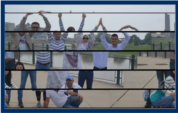
Delegates from Tajikistan showing off their Ohio spirit (May 2017)