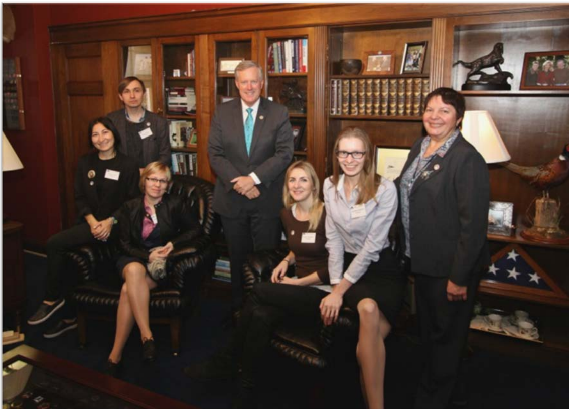
A delegation from Russia meets Rep. Mark Meadows (NC-11) to discuss issues concerning Finno-Ugric Indigenous Peoples in his Capitol Hill office prior to traveling to Hendersonville, NC. (October 2017)

From 1999 to 2017, Open World hosted more than 19,400 young Russian leaders. In calendar year 2017, the Center hosted 224 Russian participants in 35 exchanges. Delegates came from 53 of Russia's 83 regions, included a wide range of ethnic groups, and were hosted in 30 host communities in 24 U.S. states. Women made up 61 percent of the delegates.