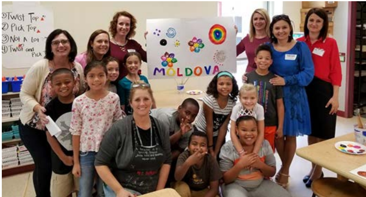
Educators from Moldova traveled to Raleigh, NC to visit schools and to explore education partnerships. (September 2017)

From 2007 through 2017, the Center hosted 442 delegates from Moldova. This year we will host 6 delegates that are pharmacy school administrators and professors. After not hosting programs for Moldova in 2016 due to limited funds, we resumed programming in 2017 at the request of the U.S. Embassy's newly arrived officers who were impressed by the breadth and quality of Open World alumni throughout the country. Program themes in 2017 focused on ophthalmology and rehabilitation, and intellectual property rights.