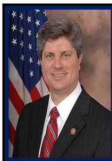
Hon. Jeff Fortenberry United States House of Representatives