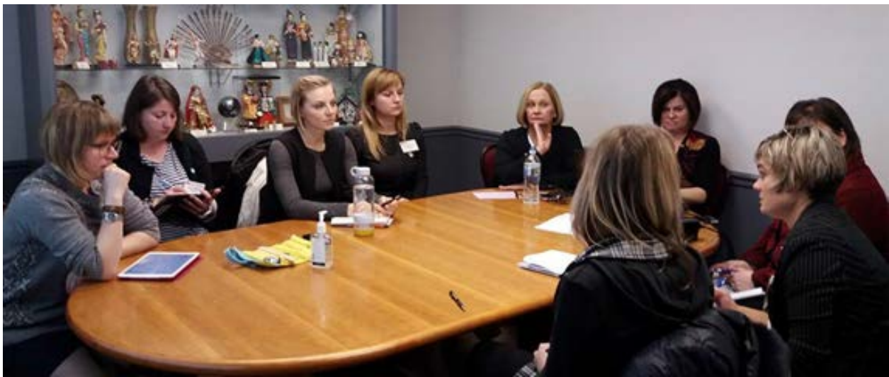
An all-women delegation from Ukraine, focusing on Issues of Internally Displaced Persons, meet with the Mayor and City Council of Akron, OH (March 2017)

Much of Open World's Ukraine program was aimed at providing Ukraine the tools it needs for self-governance, democratization, decentralization and to continue with progressive development aimed at eliminating corruption while it counters Russian aggression and use of disinformation and propaganda. To be responsive to the current needs in Ukraine, Open World's exchange programs have been expanded in areas that: focus on improving Ukrainian media's ability to counter Russian propaganda and provide its citizenry with more transparent and credible information, assist with government reform in the critical areas of anti-corruption and decentralization, further the development of a robust and pro-active civil society with the tools and skills needed to serve stakeholders and improve the lives of those they serve. Open World also works assiduously to assist our Ukrainian partners to handle the hardships caused by the aggression to the East and South (such as servicing those with battlefield injuries and post-traumatic stress disorder and helping with programs aimed at providing support for internally displaced persons).