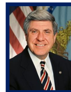
Hon. Ben Nelson Senator for Nebraska 2001-2013