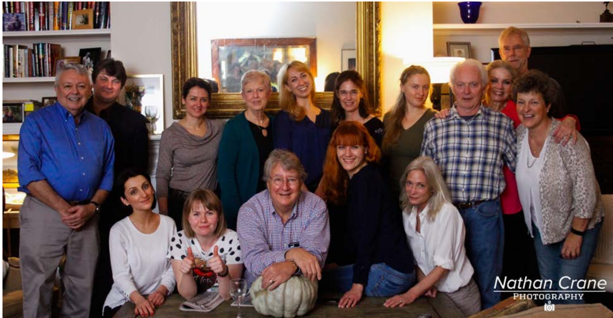
Ukrainian parliamentary staff on the theme of Legislative Development were hosted by the Palmetto Council for International Visitors in Columbia, SC. (February 2017)

who live in state capitals and other large cities, small towns, and rural communities throughout the United States.