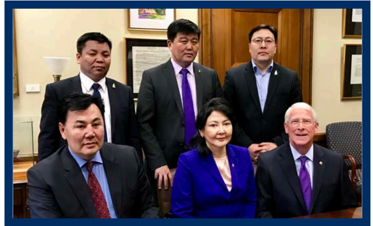
Members of Parliament from Mongolia meet with Senator Roger Wicker at his D.C. office (March 2017)