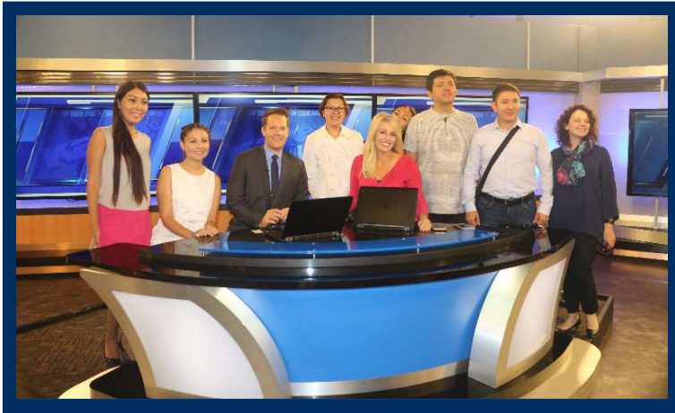
Delegates from Kazakhstan visit a local news station in Wichita (September 2017)