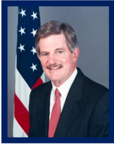
Chairman R. James Nicholson Brownstein Hyatt Farber Schreck