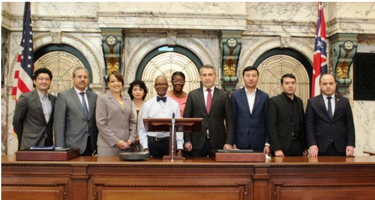
Members of Parliament from Uzbekistan visit Mississippi's State House in Jackson, MS. (November 2017)

These MP alumni also help in nominating colleagues, in guiding future themes for Open World programs, and in some instances supporting critical U.S. initiatives. One other result lies in opening the dialogue, and seeing the perceptions and positions directly from both sides. We will continue this productive program in 2018 and 2019.