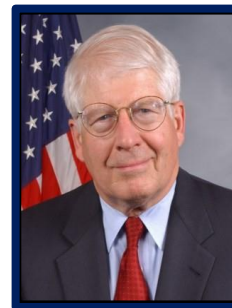
Hon. David Price United States House of Representatives