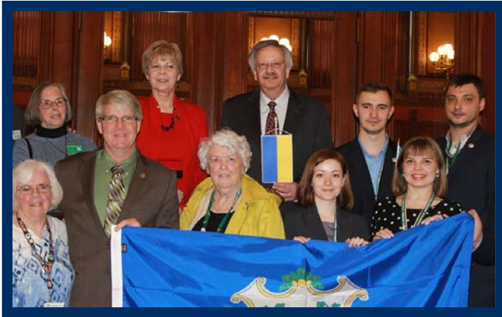
A delegation from Ukraine meeting with State Senators Tami Zawistowski and Tim Acker (April 2016)