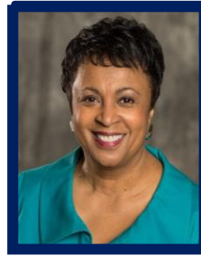
Dr. Carla Hayden Librarian of Congress