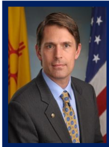
Hon. Martin Heinrich United States Senate