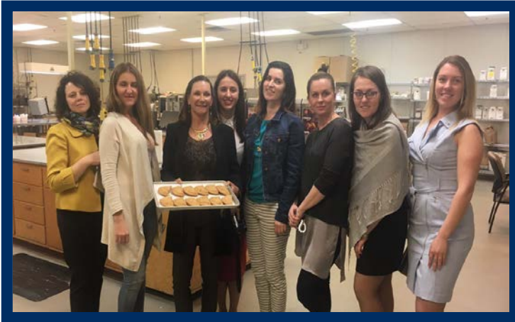
Women entrepreneurs from Russia meet with the CEO of Bama Pies, a women-owned business (March 2017)