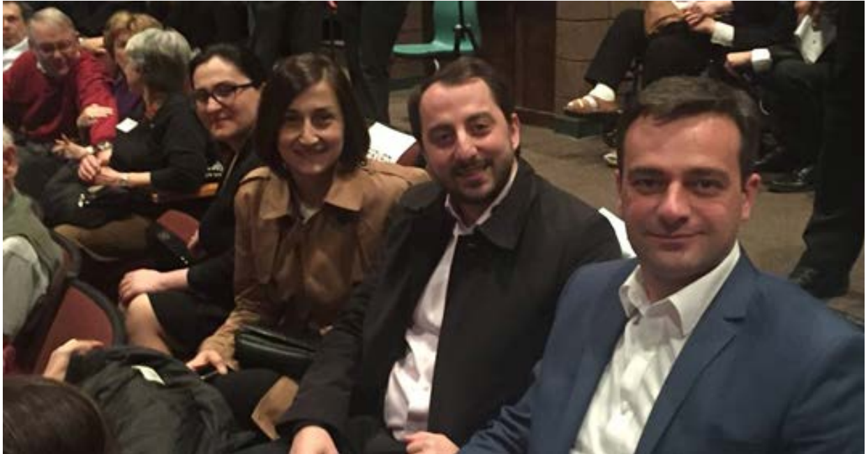
Members of the Georgian Parliament attend a town hall held by Rep. David Price in Raleigh, NC. (March 2017)