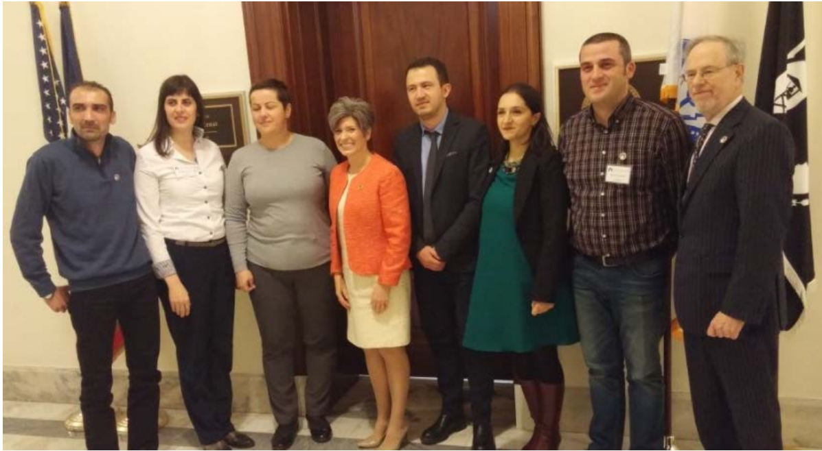
Delegates from Kosovo, focusing on Improving Election Processes and Election Management, meet with Iowa Senator Joni Ernst before traveling to Des Moines. (February 2017)

Open World’s successful hosting of our colleagues from Kosovo can be exemplified by the new life the program continues to bring to the Iowa-Kosovo sister state partnership, featuring close ties between the state’s and the country’s national guards. A recent reciprocal visit by members of the Iowa Sister State Committee involved talks with the Ministry of Education to organize a structured community college in Kosovo that would offer education on healthcare, welding, and auto-mechanics.