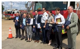
Six Ukrainians tour longview with focus on anti-corruption.

LONGVIEW, TX (KLTV) - A delegation of professional Ukrainians got a look at the inner workings of city government and services in Longview. We caught up with them as they were getting a look at the equipment used by the Longview Fire Department.