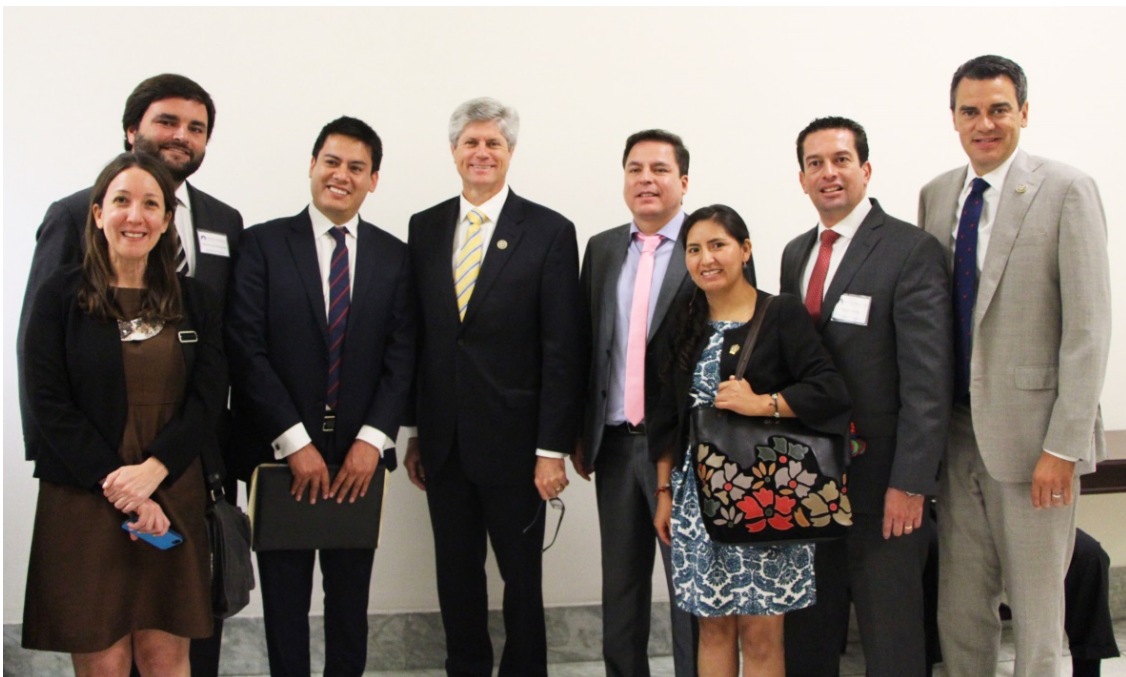
Members of Congress from Peru meet with Rep. Jeff Fortenberry (NE), (center,) and Chairman Kevin Yoder (KS), (far right), before their trip to Austin, TX. (July 2017)

The facilitator for the 2017 delegation commented that, "The most significant lesson Open World delegates learned during their experience was the importance of elected officials knowing their electorate. From their Open World experience, delegates have new ideas on how to improve communication and respond to constituents which was highly useful."