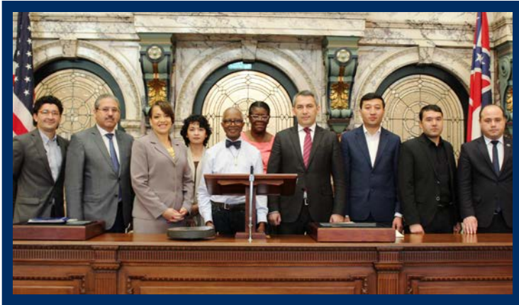
Members of Parliament from Uzbekistan visit the Mississippi State Capitol (November 2017)