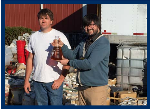
A delegate from Russia learns how to make bio-diesel from used cooking oil while in Branchville. (April 2016)