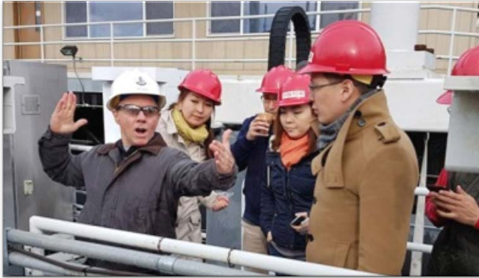
Young Entrepreneurs from Kyrgyzstan learn about the workings of the Rocky Reach Dam during their program in Wenatchee, WA. (April 2017)

Each of the speakers shared invaluable knowledge and experience with the project participants. All participants had an opportunity to ask questions.