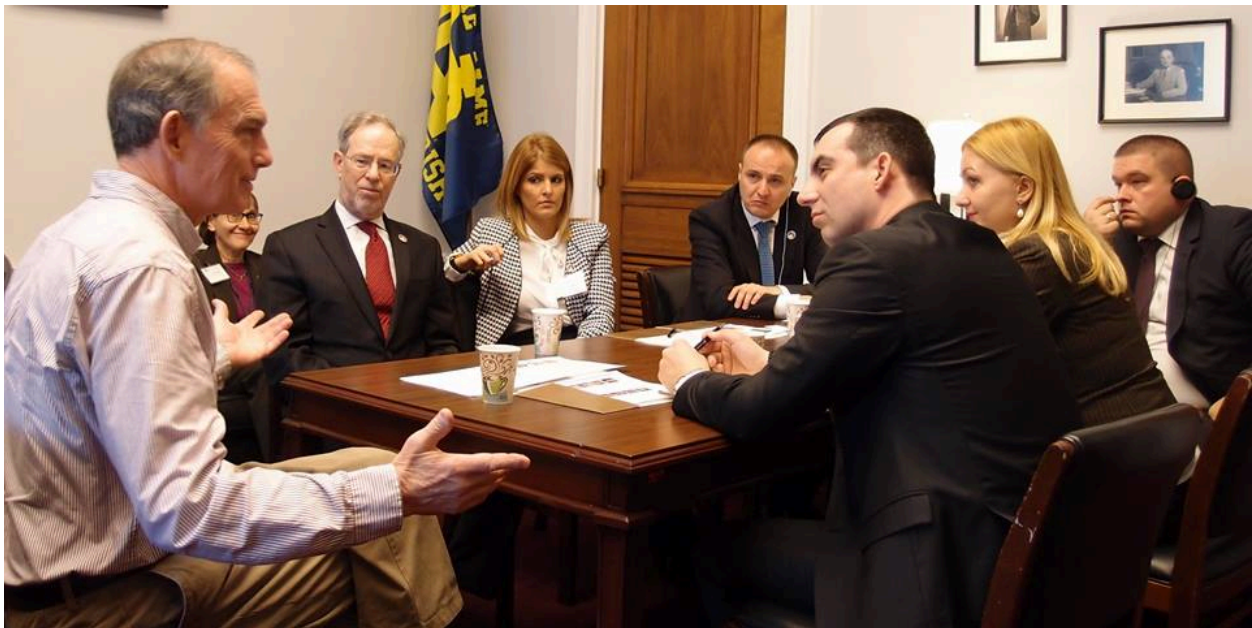
Serbian Members of Parliament met in the D.C. office of Representative Pete Visclosky (OH) before being hosted in Columbus, Ohio in January 2016.

One profound insight the delegates derive from their experience in the United States is that elected officials are accountable to the citizens of their jurisdictions. Another powerful element is the impact of home stays – Open World delegates live with American families while in the United States. Partnerships and deeper understanding forged between American hosts and the delegates multiply the connections among their communities with profound results.