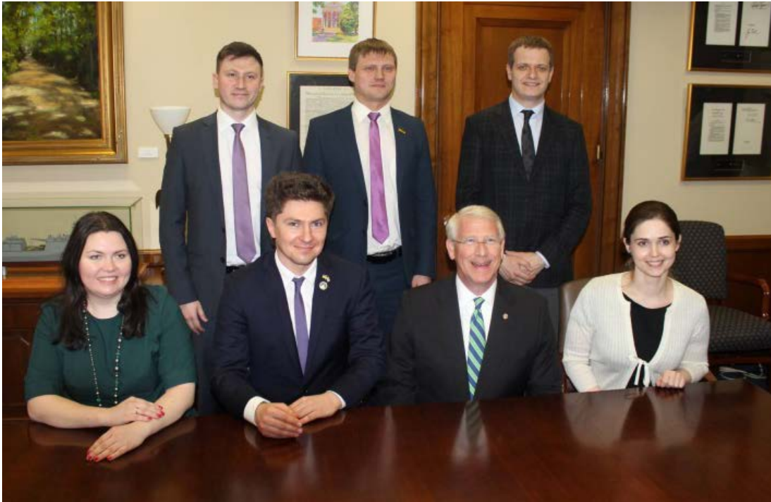
Senator Roger Wicker (MS) meets with anti-corruption experts from Ukraine in Washington, D.C. The group was hosted in Mississippi by Legacy International Development Group in March 2016.

in Ukraine such as dairy farming, hydroponics, and grains. He also reported that he is now hiring the disabled and veterans as a part of his increased efforts at corporate responsibility.