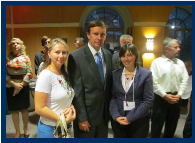
Ukrainian medical specialists pose with Sen. Chris Murphy at a Yale School of Medicine reception during their unique PTSD-related educational programming. (August 2014)