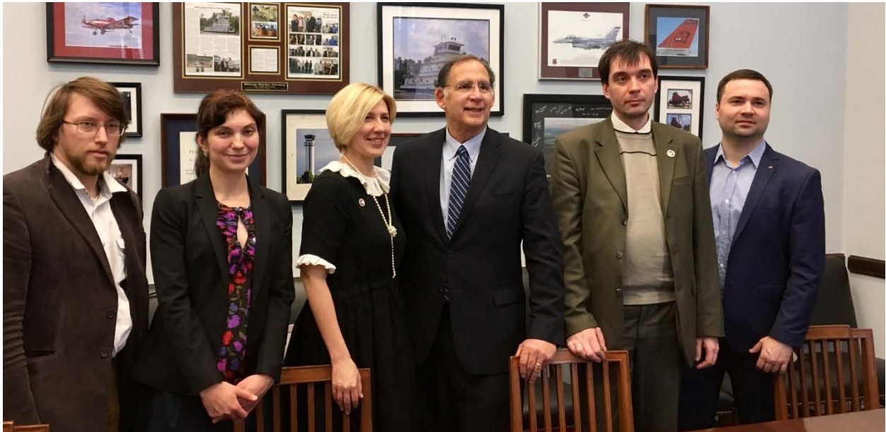
Russians traveling on the theme of Urban Development/Environment met with Senator John Boozman (AR) in D.C. before going on to Fayetteville, AR on December 2, 2016.

productive relationships. After all, our Russian friends have lived in American homes, integrated into U.S. communities, and formed lifelong ties. The time to act is now.”