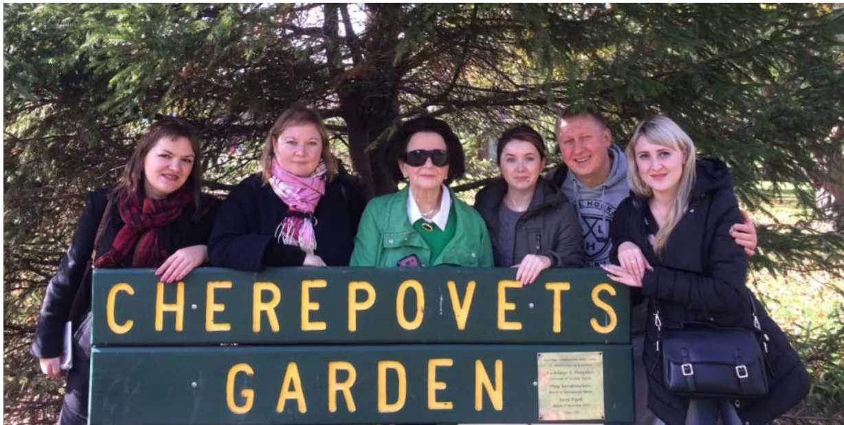
The Montclair (NJ) Rotary Club hosted a delegation nominated by their sister Rotary club in Cherepovets, Russia, and aimed to provide early help/rehabilitation/assimilation to disabled children in October 2016.

This time of significant tension between the United States and Russia has made programming for U.S. embassy-sponsored activities more difficult. We note that partnering in some fields, such as