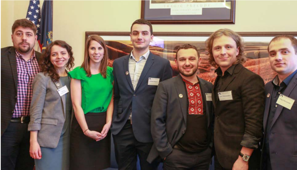
Government reform leaders from Ukraine meet with staff in the office of Rep. Kevin Yoder (KS-3). The group was hosted in Kansas City in March 2016 by Global Ties in Kansas City.