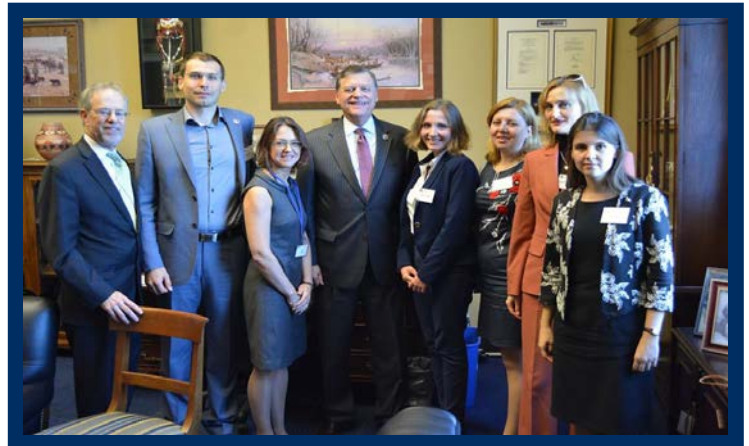
Delegates meet with Rep. Tom Cole at his office in Washington, DC. (October 2015)

Tulsa will host a delegation from Russia in March.