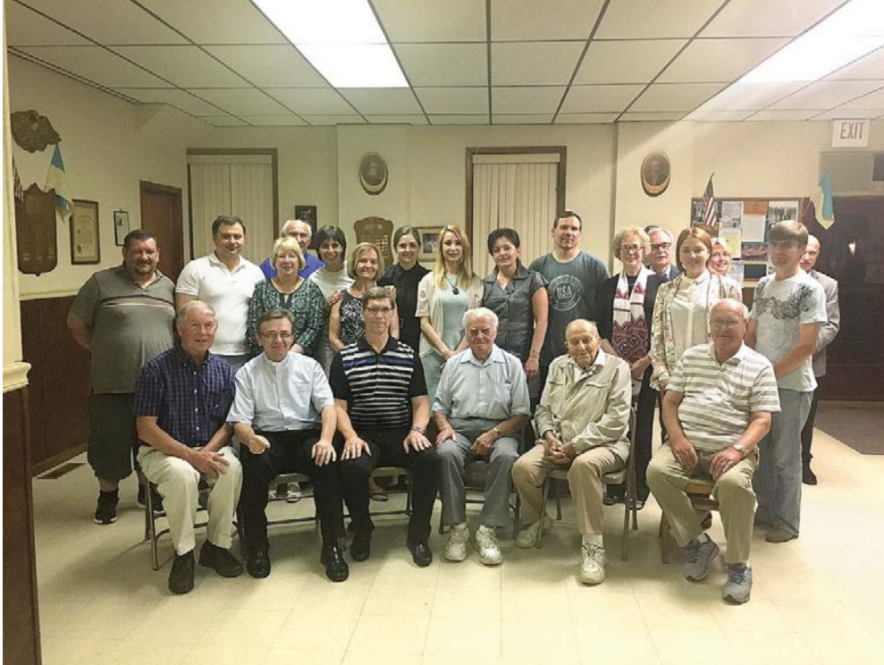
Ukrainian community members with the visiting Ukrainian national deputies at the Ukrainian American Citizens Club in Watervliet, N.Y.

The deputies commented on current conditions and challenges that face Ukraine. They explained how they held a number of discussions with congressional leaders to explain the need for the U.S. to change its policy and release more modern armaments to employ against the better equipped militants in eastern Ukraine. They said the congressmen with whom they spoke encouraged all in the community to contact their local congressional representatives to voice their support for equipping the Ukrainian army with up-to-date weaponry.