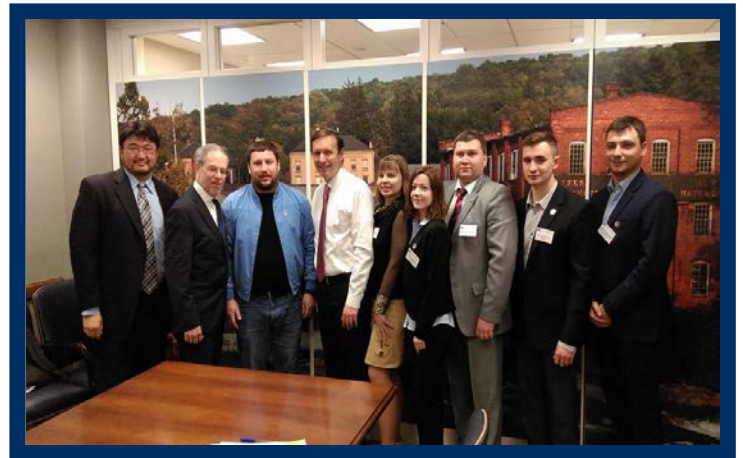
Ukrainians on an Accountable Governance program studying American voting systems meet with Senator Chris Murphy. (April 2016)