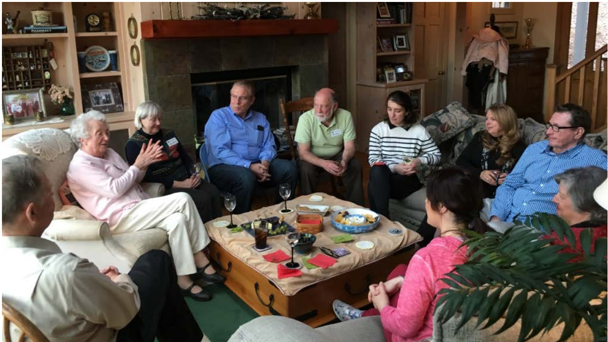
Georgians traveling to Big Canoe, Georgia in early April 2016 are welcomed into the host community on their first day there for a program concerning the development of civil society organizations