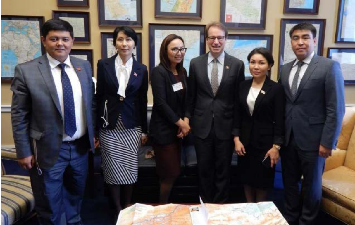
Members of the Kyrgyz Parliament meet with House Democracy Chairman Peter Roskam (IL) in May 2016. The MPs were hosted in Manchester, NH in May 2016 by the World Affairs Council of New Hampshire.

This spirit was exemplified when an alumnus organized cleanup activities in the Tashtar Ata area in May 2016 where more than 58 bags were collected and a new sense of civic pride was born.