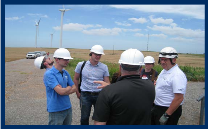
Ukrainian delegates visit a wind farm in Weatherford, OK, during an energy efficiency program based in Tulsa, OK. (June 2015)