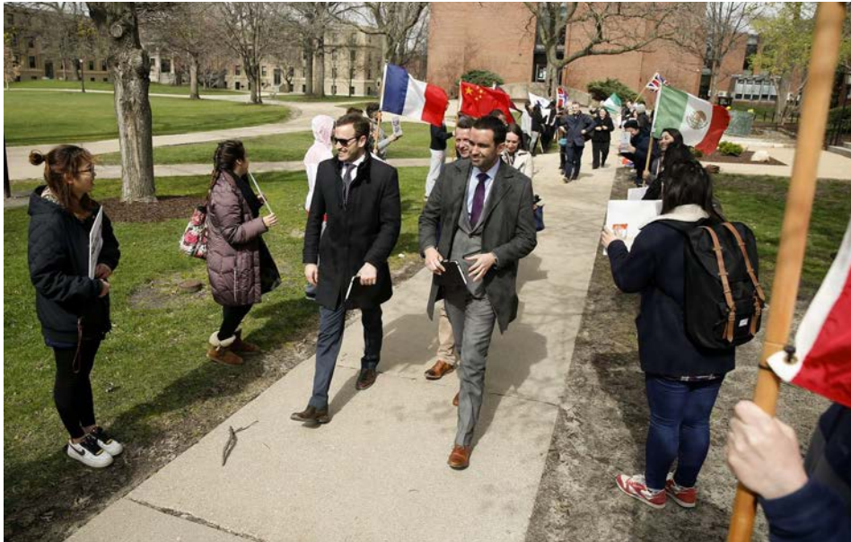
A delegation from Kosovo walks through a “parade” as they take a tour of Coe College in Cedar Rapids on Friday, Apr. 8, 2016.