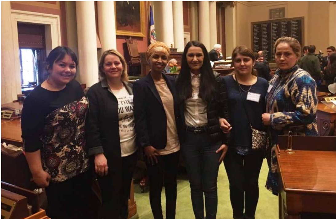
Muslim women from Tajikistan working to combat violent extremism meet with the first U.S. legislator from Somali, Ilhan Omar, at the Minnesota state legislature in March 2017.

Reflecting Open World's impact in Tajikistan, one OW alumnus recently received a grant from the U.S. Embassy to further his efforts in working with children at risk at a specialized school for juvenile delinquents, which also houses a juvenile detention center. This grant is to work with juvenile delinquents to reintegrate them with their family and back into community based on the techniques he saw first-hand in Lincoln, Nebraska. The grant also provides training for advocates for improved juvenile justice systems, vocational development, legal advice, and positive cooperation with law enforcement agencies, a new concept for Tajikistan.