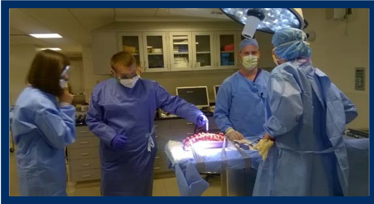
Ukrainian medical professionals learn about Telemedicine at the Ohio Medical Center. (September 2015)