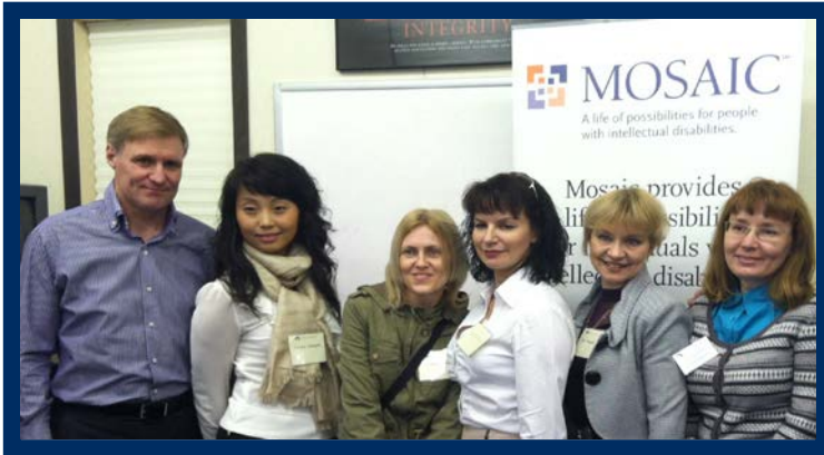
A Russian delegation visits the Mosaic organization in Winfield during an exchange on services for people with disabilities. (April 2013)