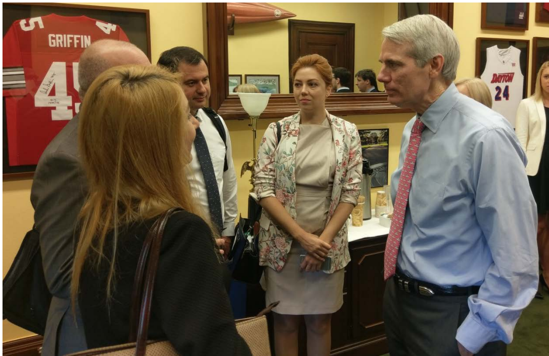
Members of the Ukrainian Parliament discuss matters of Ukraine with Senator Rob Portman (OH) in June 2016.