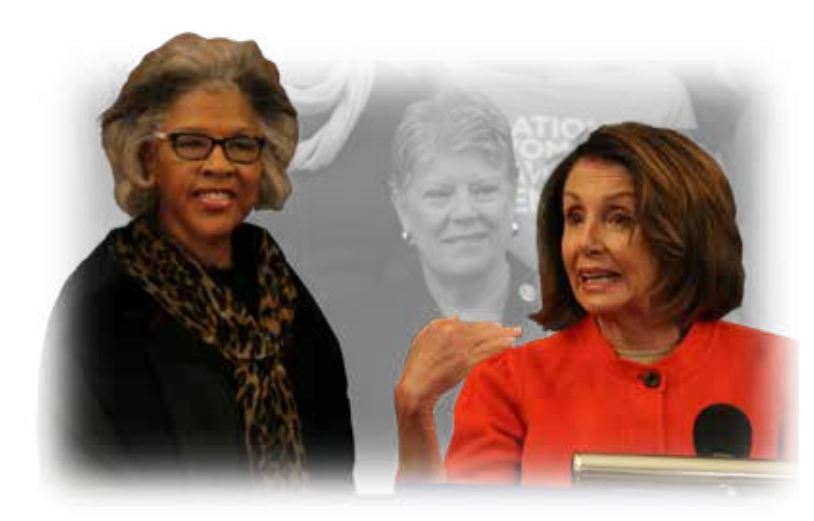
Congresswoman Beatty joins Speaker of the House Nancy Pelosi to introduce the Paycheck Fairness Act. (January 30, 2019)

"It is shameful that women today earn only 80 cents for every dollar earned by their male counterparts preforming the exact same job. That is why Congress has a responsibility to make pay equality a reality by passing the Paycheck Fairness Act. When women are given a level playing field, companies benefit, families prosper, communities grow, and our economy is stronger. When women succeed, America succeeds!"