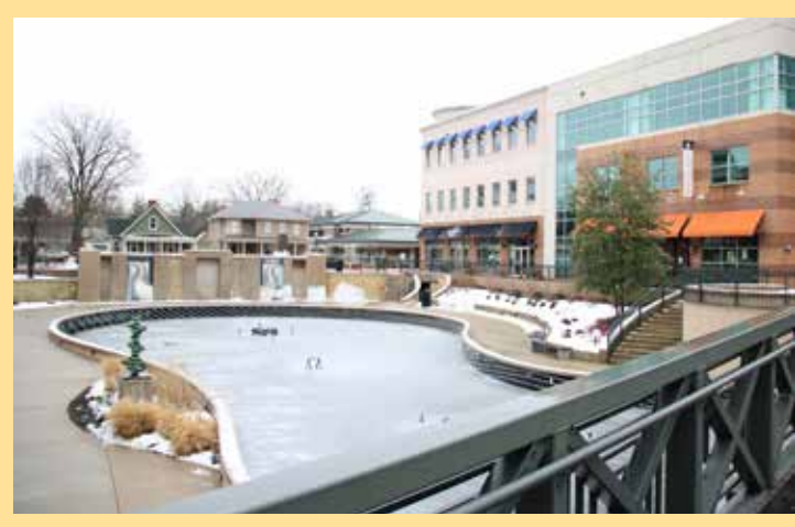
Creekside Park and Plaza in Gahanna, Ohio. (February 11, 2019)

business community. In the past, she has been a guest at the Gahanna Community Improvement Corporation's Named one of the 'Best Hometowns' by Ohio Magazine, Annual Groundhog Day Economic Forecast Breakfast as well as many other local events, and she is committed the city has more than 750 acres of parkland, 17.1 miles to helping constituents resolve problems with their Social Security, Medicare, VA, and many other federallyrelated issues.