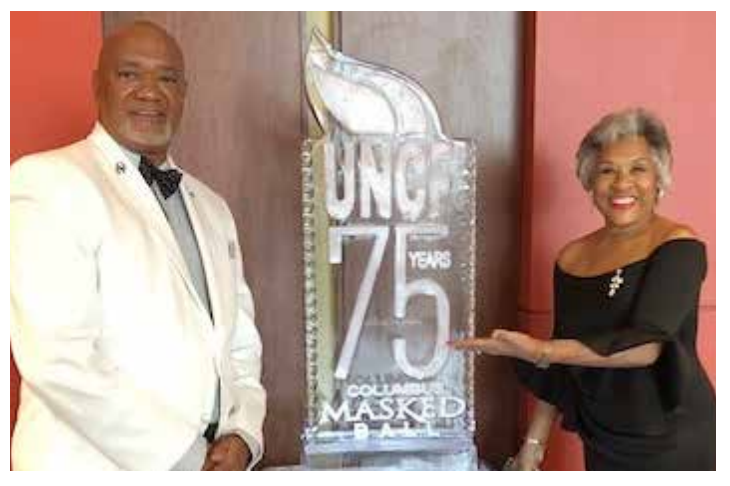
On June 8, 2019, Congresswoman Beatty speaks with the United Negro College Fund about her ongoing work in Congress and Central Ohio to expand opportunities to higher education for more young people.

provide a much-needed and meaningful pay raise to more than 27 million hardworking Central Ohioans and families across this great country," she said. "Still today, there are too many individuals and families being left behind—and many more people working multiple jobs just to keep their heads above water. The Raise the Wage Act will make a real difference in their lives