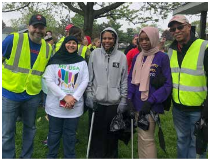
District Staff joins constituents in a community-led event to beautify the Hilltop community. (May 4, 2019)