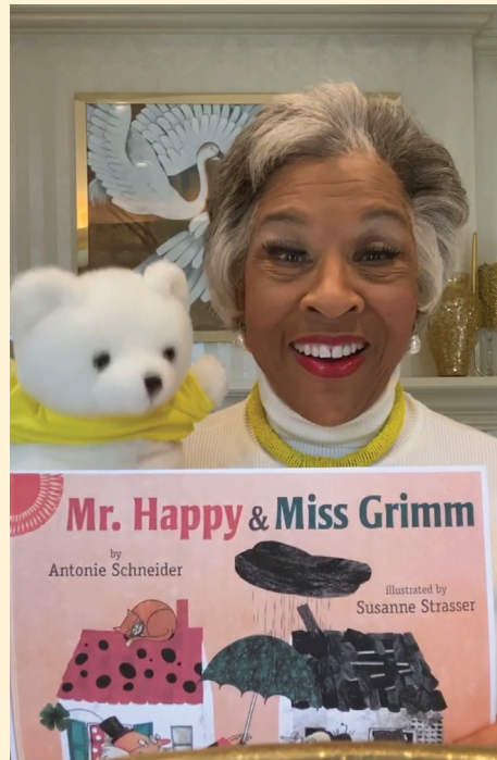
Congresswoman Beatty talks about COVID-19 while reading a book with 'Mr. Happy' (April 14, 2020)

Sign up for my newsletter to get the latest developments on my work at: www.beatty.house.gov/contact/newsletter