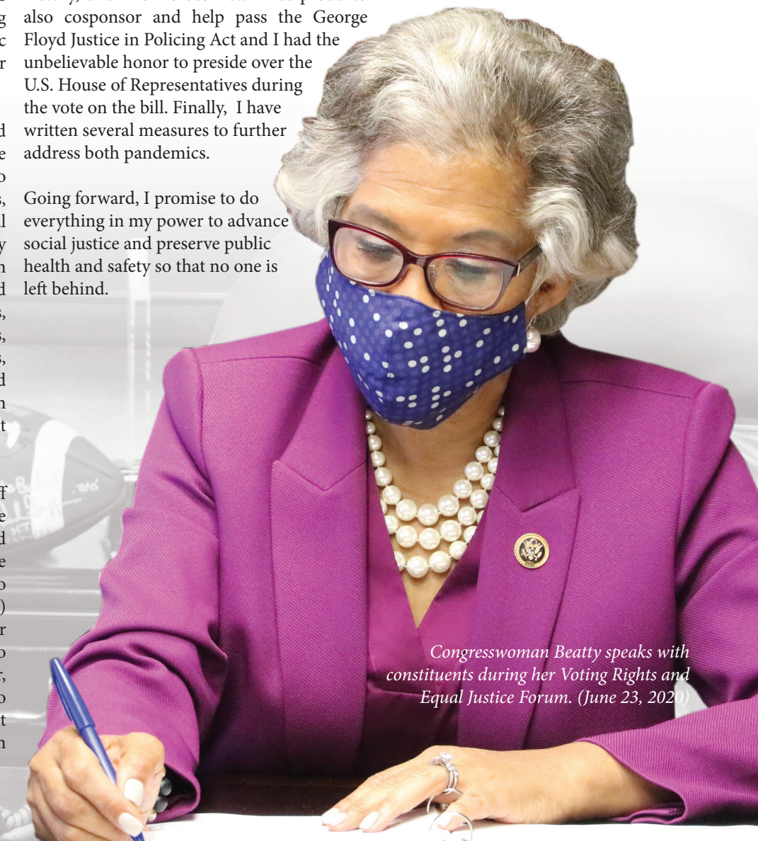
Congresswoman Beatty speaks with constituents during her Voting Rights and Equal Justice Forum. (June 23, 2020)

PS: Make sure to register to vote by October 5, 2020, and to vote on/before Election Day, Tuesday, November 3, 2020.