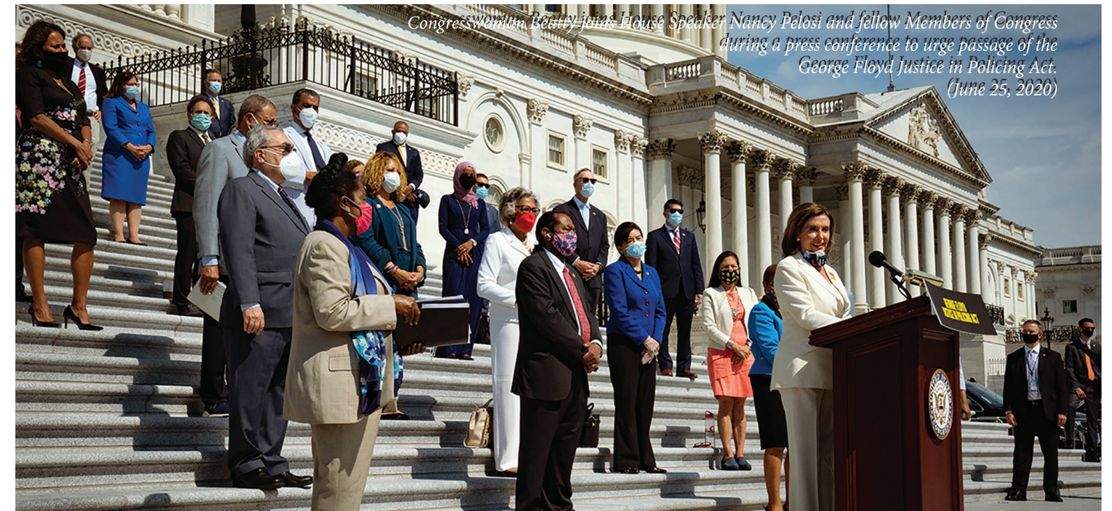
Congresswoman Beatty joins House Speaker Nancy Pelosi and fellow Members of Congress during a press conference to urge passage of the George Floyd Justice in Policing Act. (June 25, 2020)

Every day, Congresswoman Beatty and her team are continuing their efforts to ensure justice and connect the needs of her district to legislation and action. That starts with bills to address the health, safety, and security of everyone, including authoring H.Res.990, a resolution recognizing racism as a national crisis and calling for a truth and reconciliation process; cosponsoring and helping to introduce the George Floyd Justice in Policing Act (H.R. 7120); and writing legislation to halt consumer debt collection (H.R. 6332), expand forgivable loans to nonprofits (H.R. 6892) and the smallest businesses (H.R. 6893), and to 'ban the box' on small business loans (H.R. 6894). All total, Team Beatty has introduced nine measures, cosponsored an additional 60 COVID-19 response and recovery bills, and signed on to more than 150 relevant congressional letters to the Administration, House and Senate leadership, and other government officials.