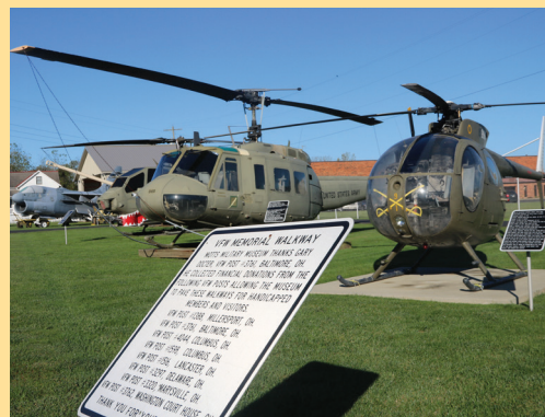
The VFW Memorial Walkway at Motts Military Museum in Groveport, Ohio. (November 30, 2017 archived photo)

As the Representative for Ohio’s Third Congressional District, Congresswoman Beatty has the privilege of representing the people of Groveport in the U.S. House of Representatives. She is dedicated to ensuring all residents have a voice in Congress and is committed to helping constituents resolve problems with their Social Security and Medicare, the VA and veterans’ services, and a whole host of other issues.