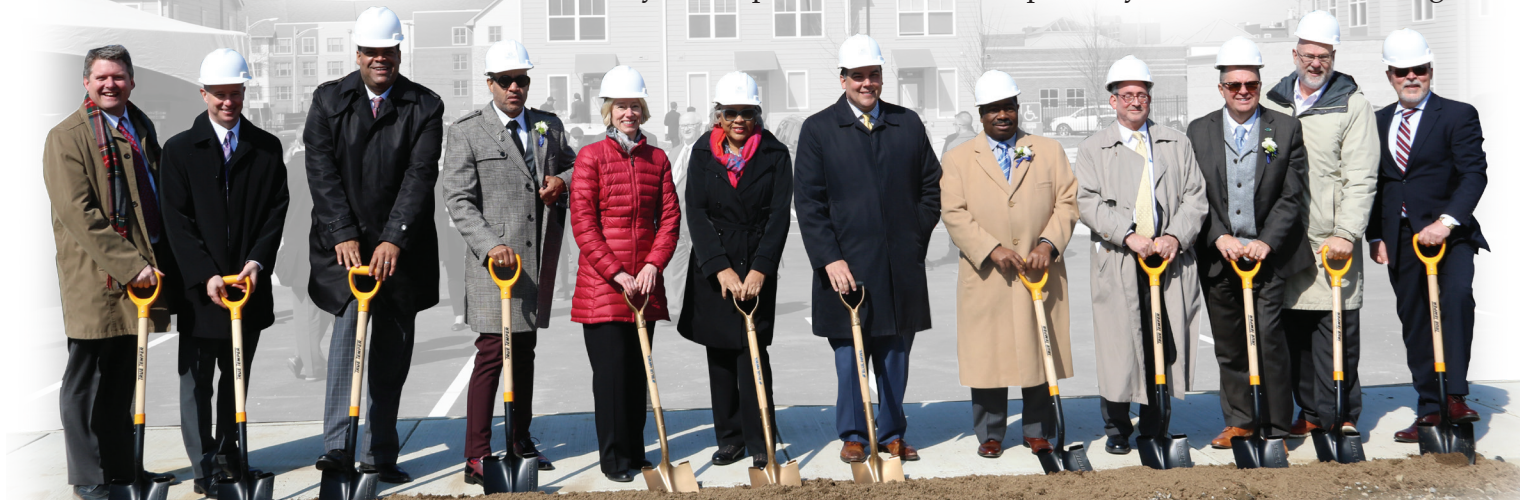
On April 5, Congresswoman Beatty (center) helped break ground on the final phase of Legacy Pointe at Poindexter. In 2014, she secured $30 million in federal funds to begin the redevelopment project to expand affordable housing options in Columbus' Near East Side.

housing options, as well as to provide more ladders of hope for hardworking families no matter their zip code. I was proud to have helped secure the needed federal funds to help transform the Near East Side, and look forward to welcoming 'home' Legacy Pointe's future residents. In the meantime, I will continue working with city, state and federal officials to ensure everyone everywhere has access to safe, secure and—most importantly—affordable housing."