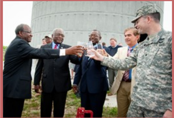
Rep. Jim Clyburn and officials cheers with the first glass of water poured from the newly completed 180 ft. John W. Matthews Industrial Park Water Tank.

Water Attracts Jobs. Water is the lifeblood of any community, without which there can be no farming, no economic activity and no jobs. I was proud to sponsor the Congressionally-directed funding for the Lake Marion Regional Water Agency, a federally funded water system that offered surface water for residential and industrial use for the first time in four rural counties (Calhoun, Orangeburg, Dorchester, and Berkeley) in 2008. Access to this water is improving health outcomes and driving economic development.