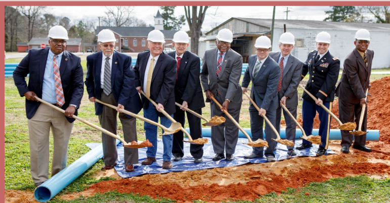
Rep. Jim Clyburn (center) & officials from the Lake Marion Regional Water Agency, Santee Cooper & the Army Corps of Engineers break ground on the 10.6 mile Dorchester Reach, February 12, 2018.

A Better Deal to Rebuild America will (1) invest in our transportation infrastructure including roads, bridges, airports, rail, and ports; (2) expand and replace outdated water and sewer systems in communities all over America; and (3) upgrade our community facilities including schools and hospitals and expand high-speed Internet to close the rural-urban divide.