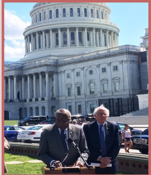
Representative Jim Clyburn joins Senator Bernie Sanders in introducing Community Health Center legislation at the U.S. Capitol in Washington, DC, June 26, 2017.

Hospitals and Health Centers for ALL Communities. Just as the New Deal and Fair Deal erected courthouses and post offices in communities across America, modern infrastructure legislation should create or expand hospitals and health centers throughout the country. Funding for Community Health Centers was recently extended for two years.