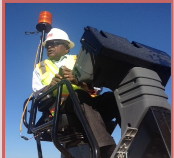
Congressman Clyburn visits asphalt plant site in Orangeburg, SC.

Sustainable Solutions to Traffic Gridlock. Transit projects like the proposed Bus Rapid Transit line from Summerville to downtown Charleston and road construction projects like the Malfunction Junction overhaul in Columbia need federal support or will languish for years. Moreover, privatizing major highways like I-26 or I-20 means imposing steep tolls to line the pockets of the highest bidder. We know that decisions motivated by profit alone will continue to leave many rural communities behind. A Better Deal to Rebuild America will invest $1 trillion into our infrastructure, giving local communities an economic boost and working families a better daily commute.