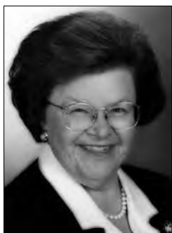
Barbara A. Mikulski (D-MD) Chairwoman 2012-Present

Senator Barbara A. Mikulski became the first woman and first Marylander to chair the Committee on December 20, 2012. She was first appointed to the committee in 1987. In addition to her full committee duties, she serves as chairwoman of the Subcommittee on Commerce, Justice, Science, and Related Agencies.