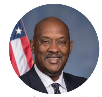
Rep. Dwight Evans (PA-02)