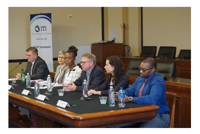
Artificial Intelligence Panel