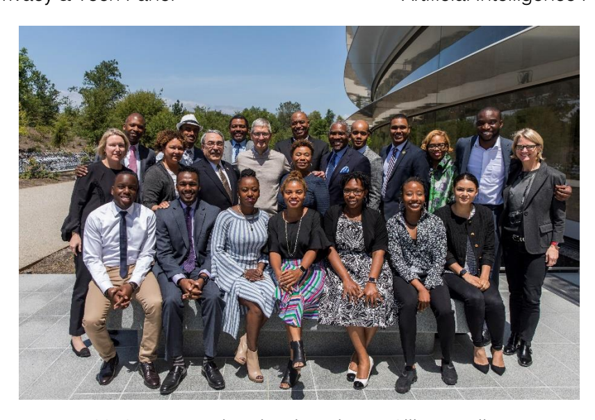
2018 Congressional Delegation to Silicon Valley