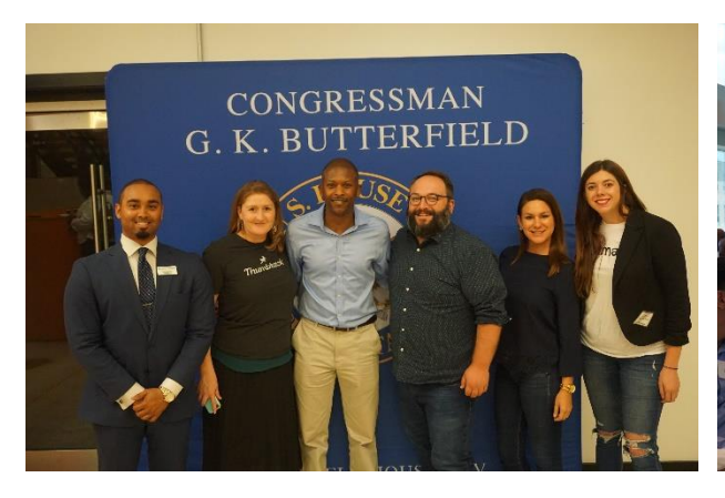
Make More Money - There's an App for That