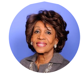
Rep. Maxine Waters (CA-43)