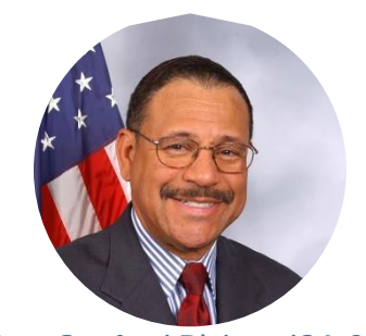
Rep. Sanford Bishop (GA-02)