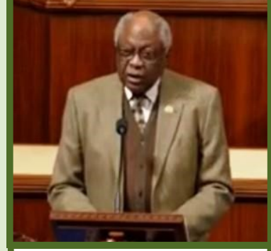
Congressman Jim Clyburn speaking on the House Floor in opposition to the Republican tax bill. December 19, 2017.

It also excludes profits from "tangible assets" like manufacturing plants and equipment from the minimum tax, thereby creating a tax incentive to build factories overseas, not in the U.S.