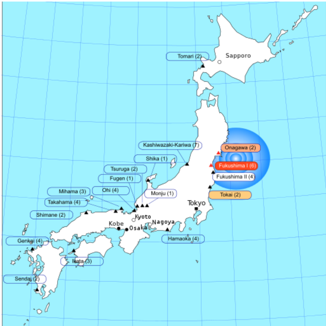
Map: Japan’s Nuclear Power Plants Highlighting Those Affected by the 2011 Earthquake and Tsunami