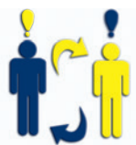
Learn & Share Knowledge