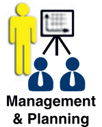
Management & Planning