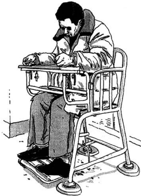
Illustration of a suspect restrained in what the police call an "interrogation chair," but commonly known as a "tiger chair." Former detainees and

The 145-page report, " Tiger Chairs and Cell Bosses: Police Torture of Criminal Suspects in China ," is based on Human Rights Watch analysis of hundreds of newly published court verdicts from across the country and interviews with 48 recent detainees, family members, lawyers, and former officials. Human Rights Watch found that police torture and ill-treatment of suspects in pretrial detention in China remains a serious problem. Among the findings are that detainees have been forced to spend days shackled to "tiger chairs," hung by the wrists, and treated abusively by "cell bosses" – fellow detainees