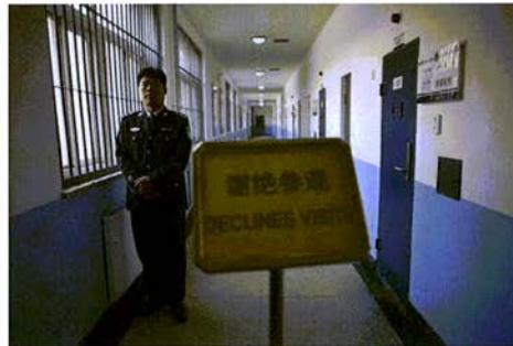
A police officer guards a corridor that is forbidden for visiting journalists to see during a government-organized tour of the Number One Detention Center in Beijing, Oct. 25, 2012.