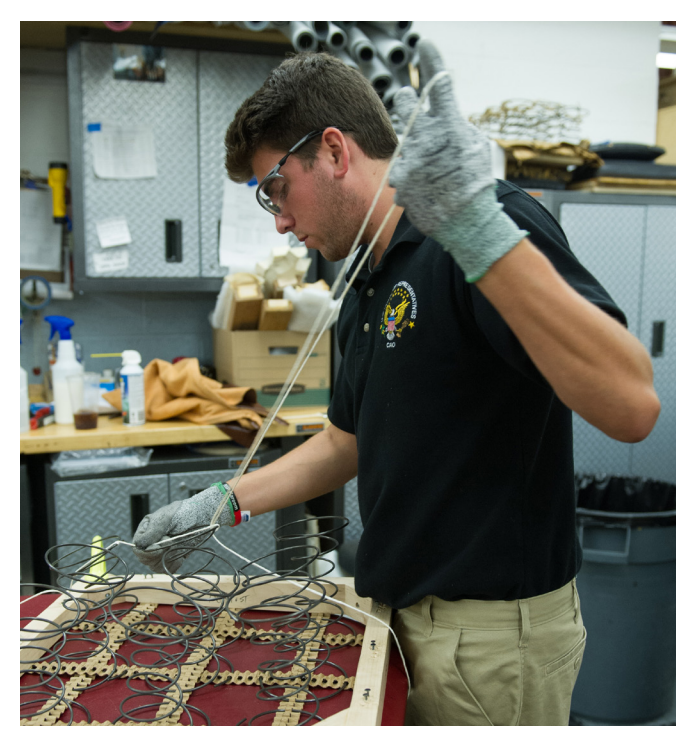
Skilled craftsmen in the CAO upholstery shop rebuild the seats for the House Floor.