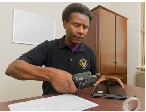
Staff in Logistics and Support inventory items as part of the CAO's Asset Management program.