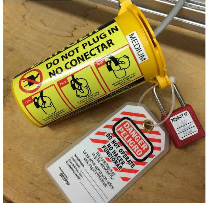
Two examples of the various lock-out, tag-out devices used on House equipment.