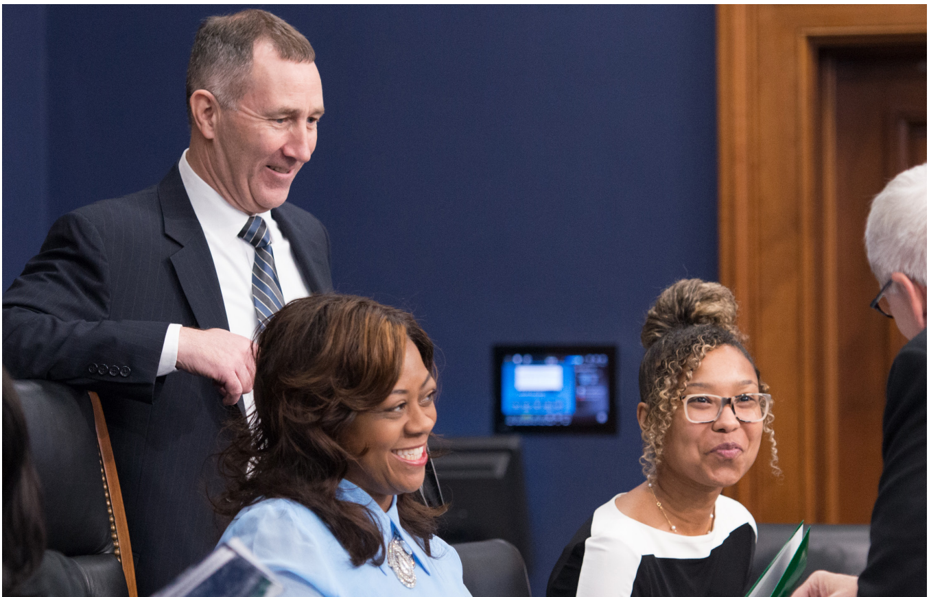
CAO staff take part in aiding Freshman Members and their staff in transitioning into their new roles.