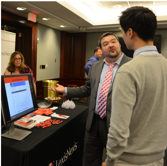
LexisNexis, one of the research subscription vendors at the 2016 Social Media Expo, provides a demo of their services.