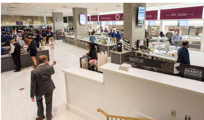
The newly-renovated Longworth Cafeteria.

In 2017, as a result of a customer survey conducted during the last quarter of 2016, Sodexo will revise the menu in the Capitol Market to provide more hot foods and an expanded deli.