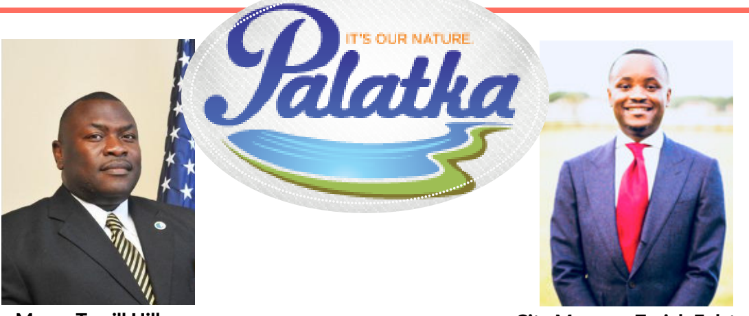
Mayor Terrill Hill