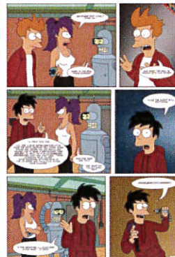
Futurama Fan Art