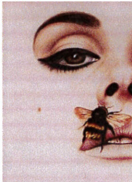
Lana Del Rey Fan Art

If you are using collaged images the work submitted must include substantial changes to the original work. Changing the medium or adjusting color does not transform the original source material.