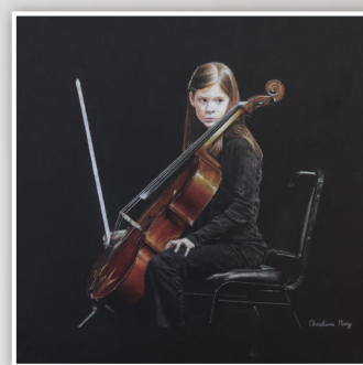
2017 Overall winning piece titled, "Life of an Artist"

Congressman McCarthy will host an event for participants and their guests.