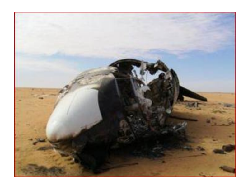
Pictured above is a cocaine-filled 727 aircraft which departed from Venezuela and landed in Gao, Mali in October 2009. The plane became stuck in the sand and was burned on the spot.

While West Africa's geographical position between South America and Europe certainly helps to account for its increasing use as a drug transit zone, the region also has a number of specific vulnerabilities which make it more prone to drug trafficking. According to the Congressional Research Service, these include: