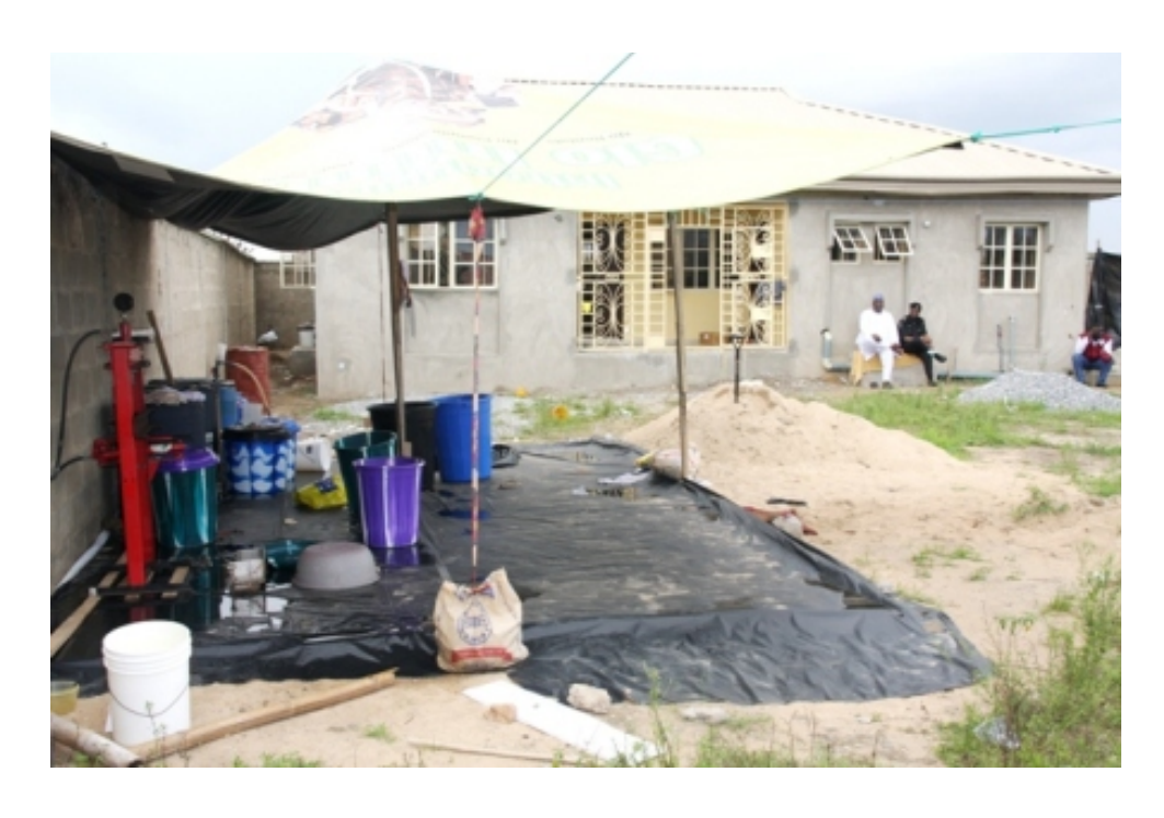
Pictured above is a methamphetamine laboratory discovered in Lagos, Nigeria in July 2011 with a capacity to produce 150 to 200 kilograms of methamphetamine per week.

By April 2013, Nigerian law enforcement discovered its fifth illegal production center. <sup>65</sup> News reports at the time mentioned that a Colombian national had been linked to the establishment of multiple such laboratories, and had been arrested. <sup>66</sup>