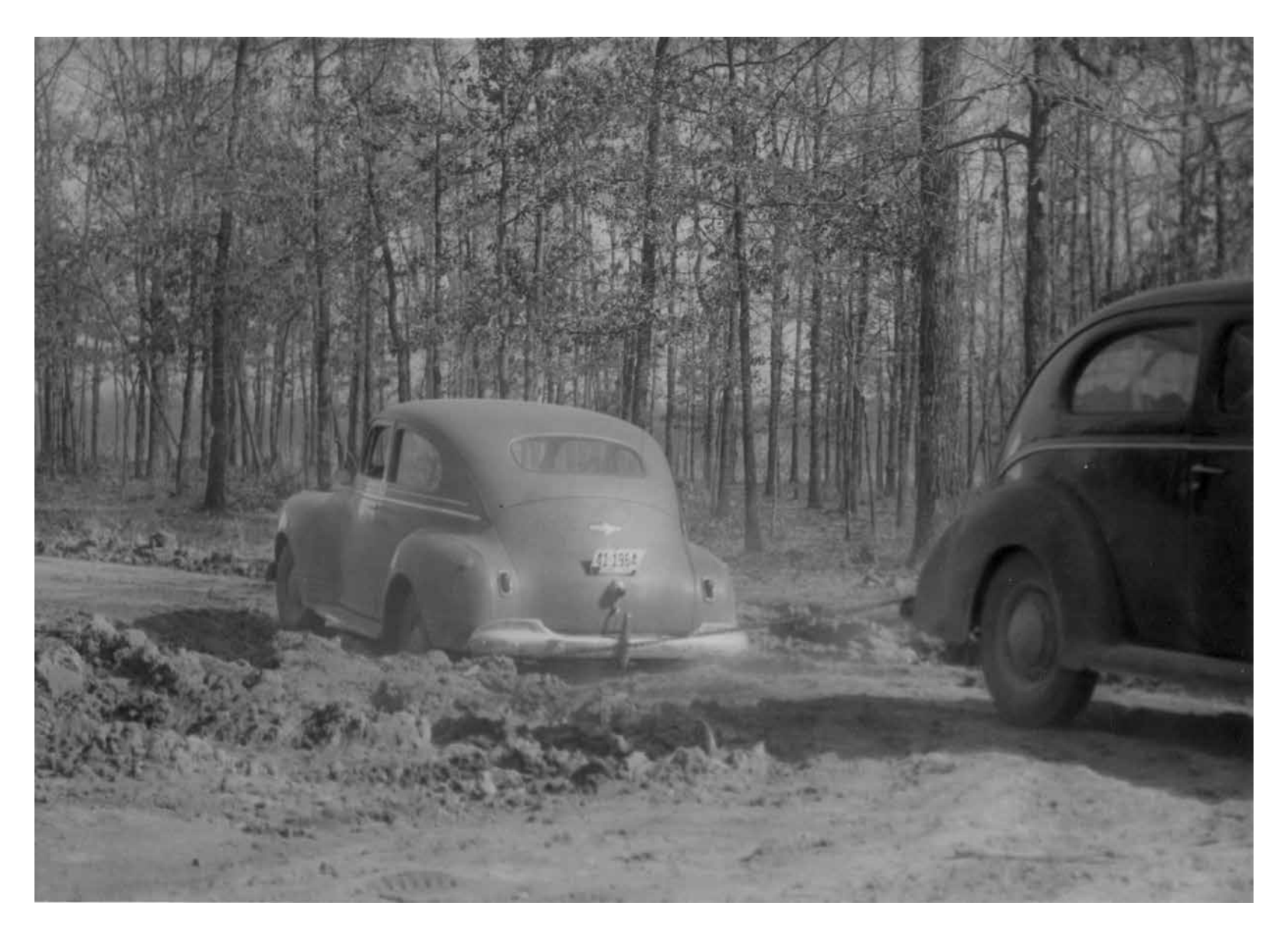
Photograph of cars from the 1940s