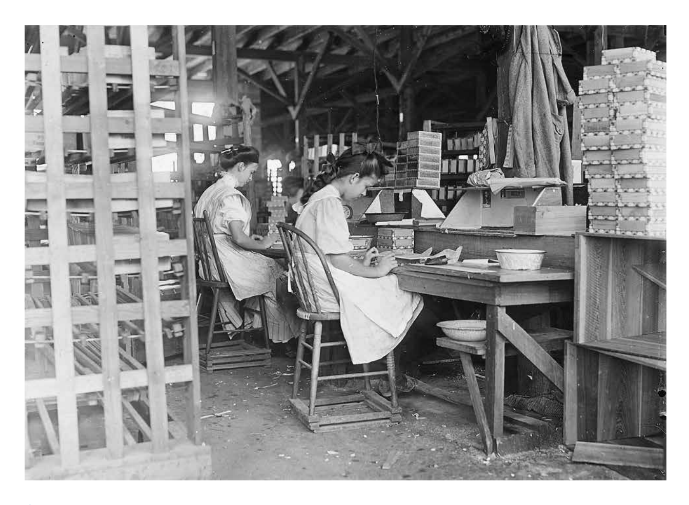
Girl Working in Box Factory, Tampa, FL January 28, 1909