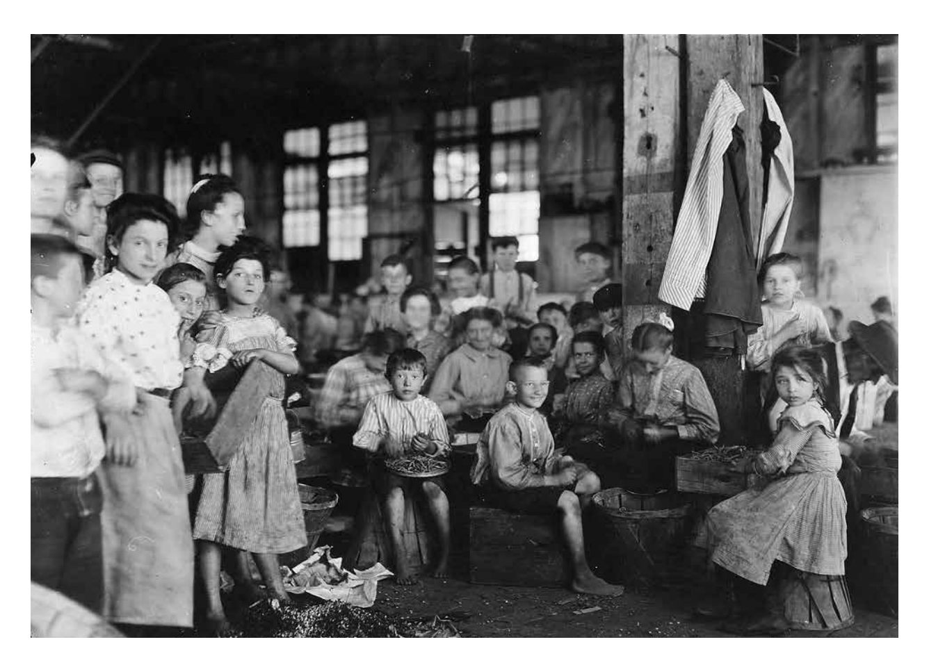
Workers Stringing Beans, Baltimore, MD