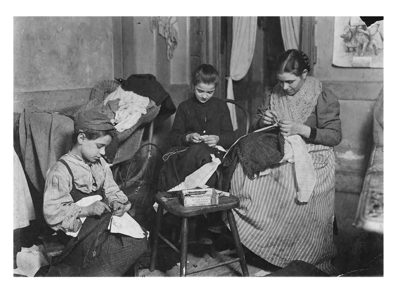
Garment Workers, New York, NY