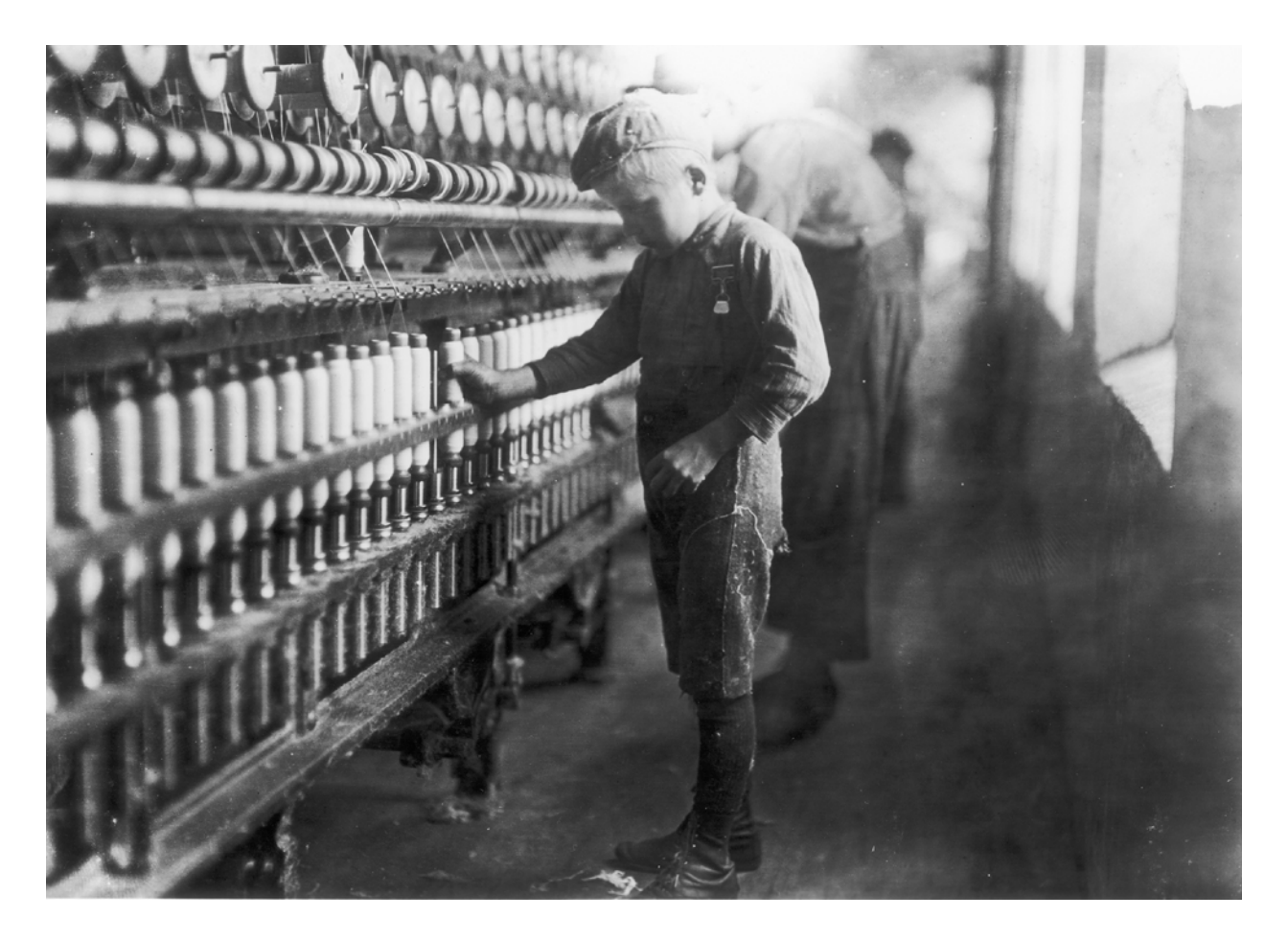
Photographer Lewis Hine documented child labor to urge passage of legislation protecting children from abuse.