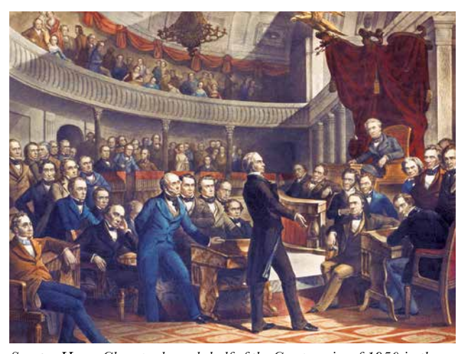
Senator Henry Clay speaks on behalf of the Compromise of 1850 in the Old Senate Chamber.

The original Capitol was designed by Dr. William Thornton, and the cornerstone was laid by President George Washington on September 18, 1793. Benjamin Henry Latrobe and Charles Bulfinch, among other architects, directed its early construction. In 1800, when the government moved from temporary quarters in Philadelphia to Washington, D.C., the Capitol that awaited them was an unfinished brick and sandstone building. The Congress moved into the small, cramped north wing. At first, the House met in a large room on the second floor intended for the Library of Congress, and the Senate met in a chamber on the ground floor. Between 1810 and 1859, the Senate used a chamber on the second floor, now known as the Old Senate Chamber.