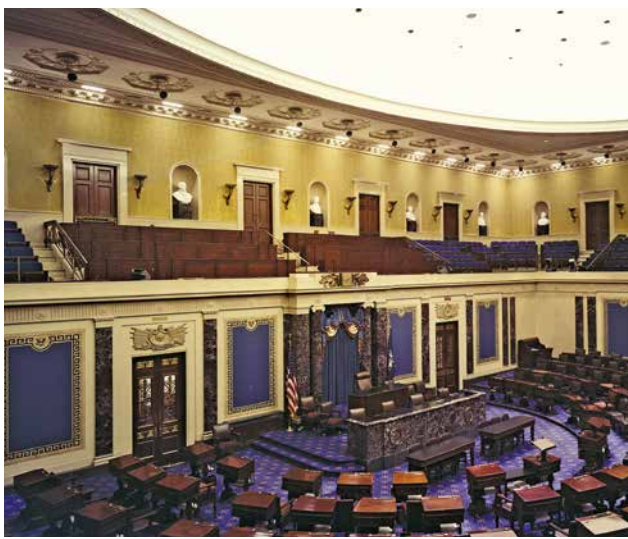
The Senate Chamber.

The Senate moved into its current chamber when the new north wing of the Capitol was completed in 1859.