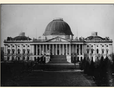
The first known photograph of the Capitol was taken in 1846 (below left).