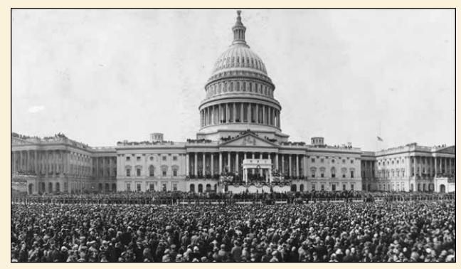
Presidential inaugurations have taken place at the Capitol since 1801. Seen here is Calvin Coolidge's inauguration in 1925.