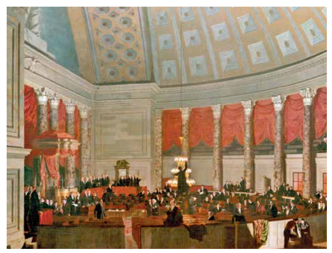
The Old Hall of the House of Representatives, as painted by Samuel F.B. Morse, in the collection of The Corcoran Gallery of Art.

In 1807, the south wing of the Capitol was completed for the House of Representatives. A wooden walkway across the vacant yard intended for the domed center building linked the House and Senate wings. This was how the Capitol appeared in August 1814, during America's second war with Great Britain, when British troops burned the Capitol and other public buildings in Washington. The exterior walls survived, but much of the interior was gutted.