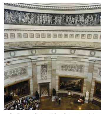
The Rotunda is a highlight of a visit to the Capitol.

During your visit to the Capitol, you may also want to visit the offices of your senators and representative or watch the House or Senate in