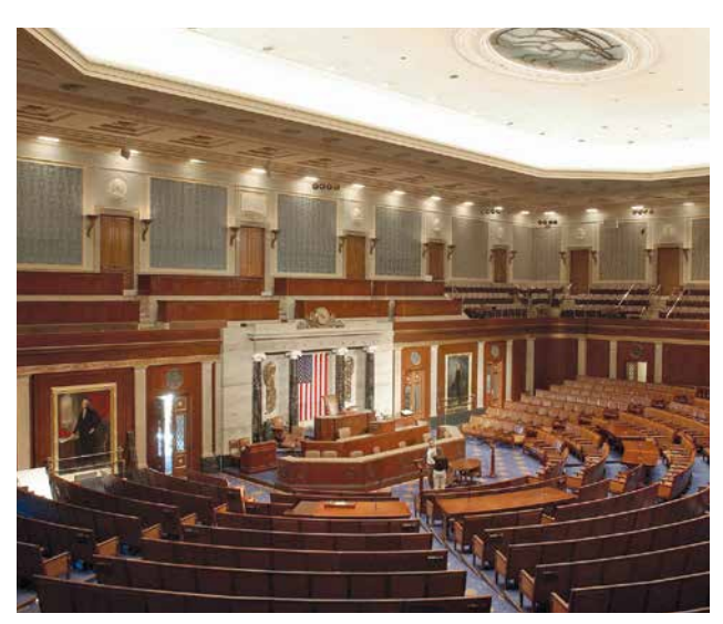
The Chamber of the House of Representatives.