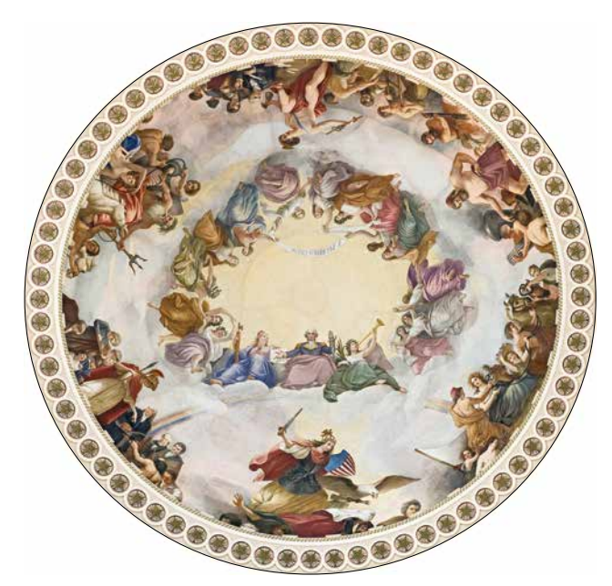
Constantino Brumidi painted "The Apotheosis of Washington" inside the Capitol Dome in 1865.

The most recent addition to the Capitol is the Capitol Visitor Center, constructed beneath the East Plaza and completed in 2008. The facility includes an exhibition hall, orientation theaters, a restaurant, gift shops, a connection to the Library of Congress, and functional improvements for the Capitol.