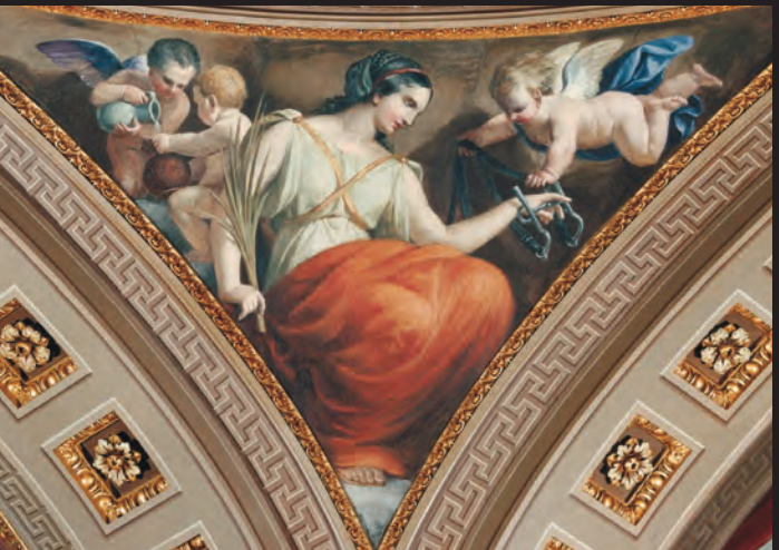
TOP: Constantino Brumidi, War detail from the Apotheosis of Washington, 1865. LEFT: Prudence gazes into a mirror, here not a symbol of vanity but meant to convey the idea of reality, as opposed to what might be imagined. Next to her is a snake, signifying wisdom. RIGHT: Temperance touches a bridle while a winged cherub pours water into wine, signifying physical and mental control.