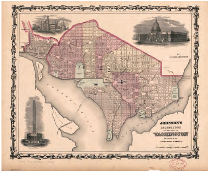
CLOCKWISE FROM LEFT: Ball gowns of distinguished ladies who attended Lincoln's 1861 inaugural ball. City Hall, adjacent to the ballroom, was the location of dressing rooms for attendees. Map of Washington, D.C. printed in 1861, showing the location of the City Hall at the time.

Apparently, the word "palace" was not lightly used, as the paper also reported, "The room itself is much larger than any ever before erected in this city for a similar purpose; and in all its arrangements reflects the highest credit upon all engaged in its construction."