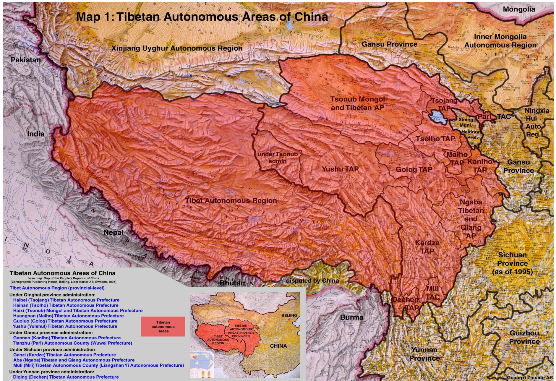
Map 1: Tibetan Autonomous Areas of China