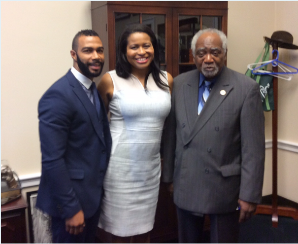
Interesting conversation with Omari Hardwick on empowering African American Community.