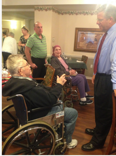
(Rep. Hultgren meets with residents of Grand Victorian-Sycamore)

We must continue to make Illinois a strong state economically and allow our businesses to expand and hire workers young and old. We must respect our seniors by protecting our social safety net programs, while at the same time preserving them for future generations. And we must honor their legacy by making sure America remains strong in the world.