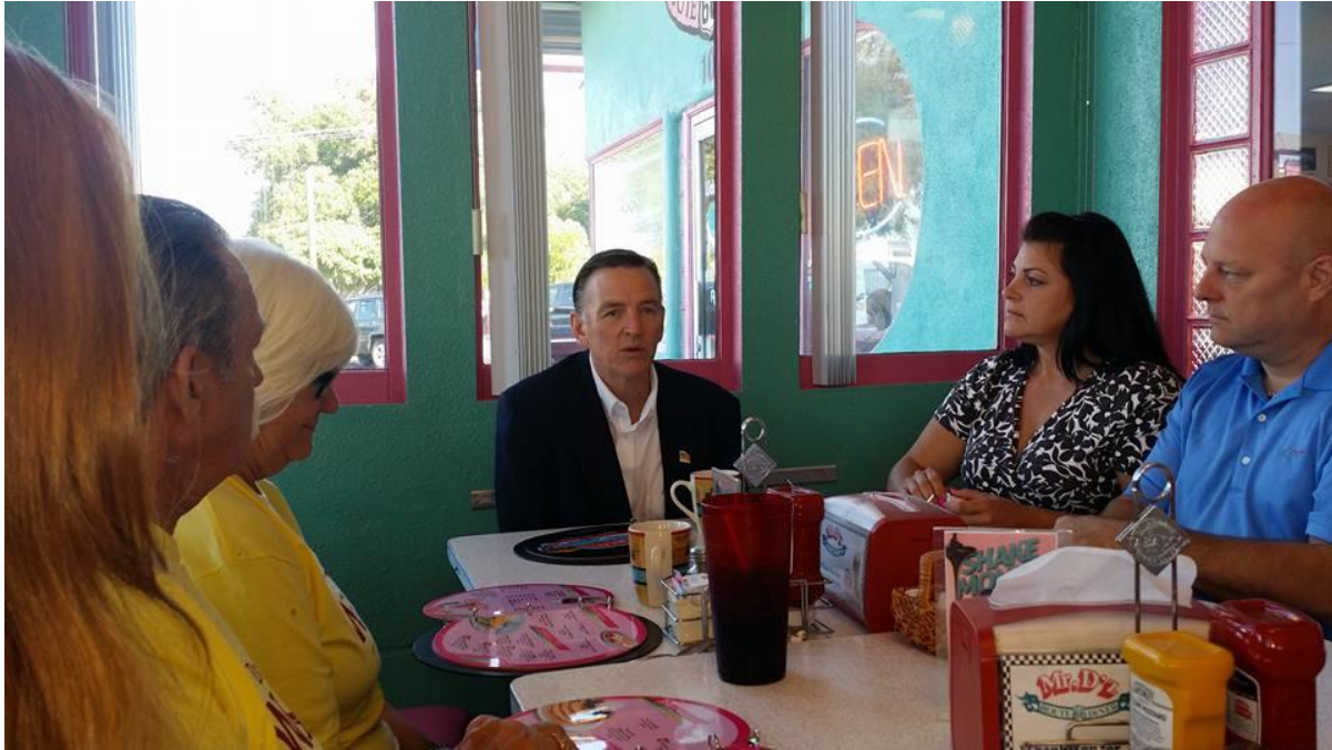
Grabbing a quick bite at Mr D'z Route 66 Diner in Kingman.