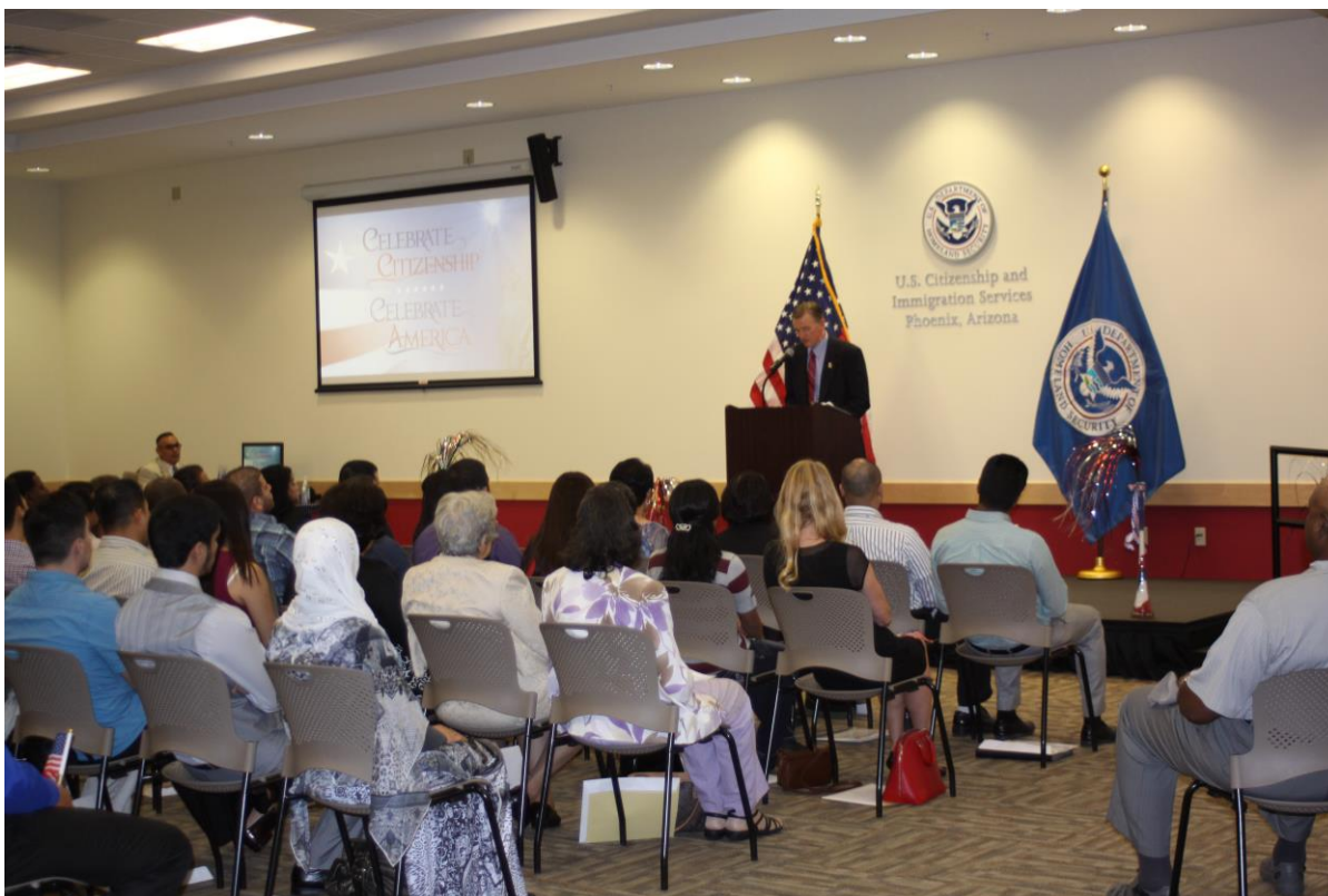
Giving the keynote address at a Naturalization Ceremony held in Phoenix on August 11 th .

So far it has been a great month as I've made stops in Buckeye, Sun City West, Gold Canyon, Payson, Kingman, Prescott and Chino Valley just to name a few. I will continue to announce my upcoming events on my Facebook and Twitter pages along with sending out updates on my e-newsletter. Below are some of the highlights so far for this month.