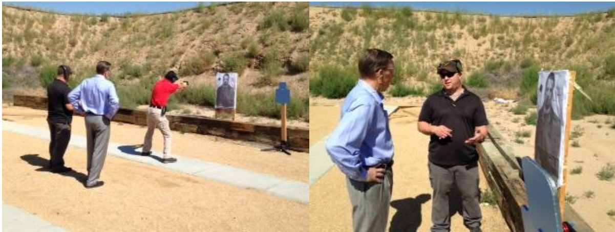
Taking a tour of the Chino Valley Police Tactical Training Range and putting my aim to the test.