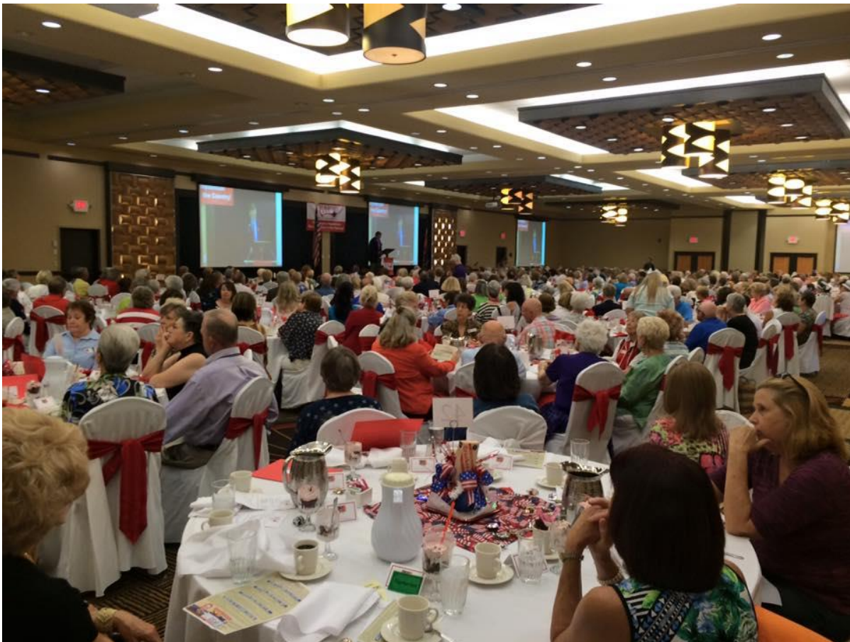
Speaking to the Republican women of Prescott on Tuesday. They are always a lively group and it was great speaking to a packed house!