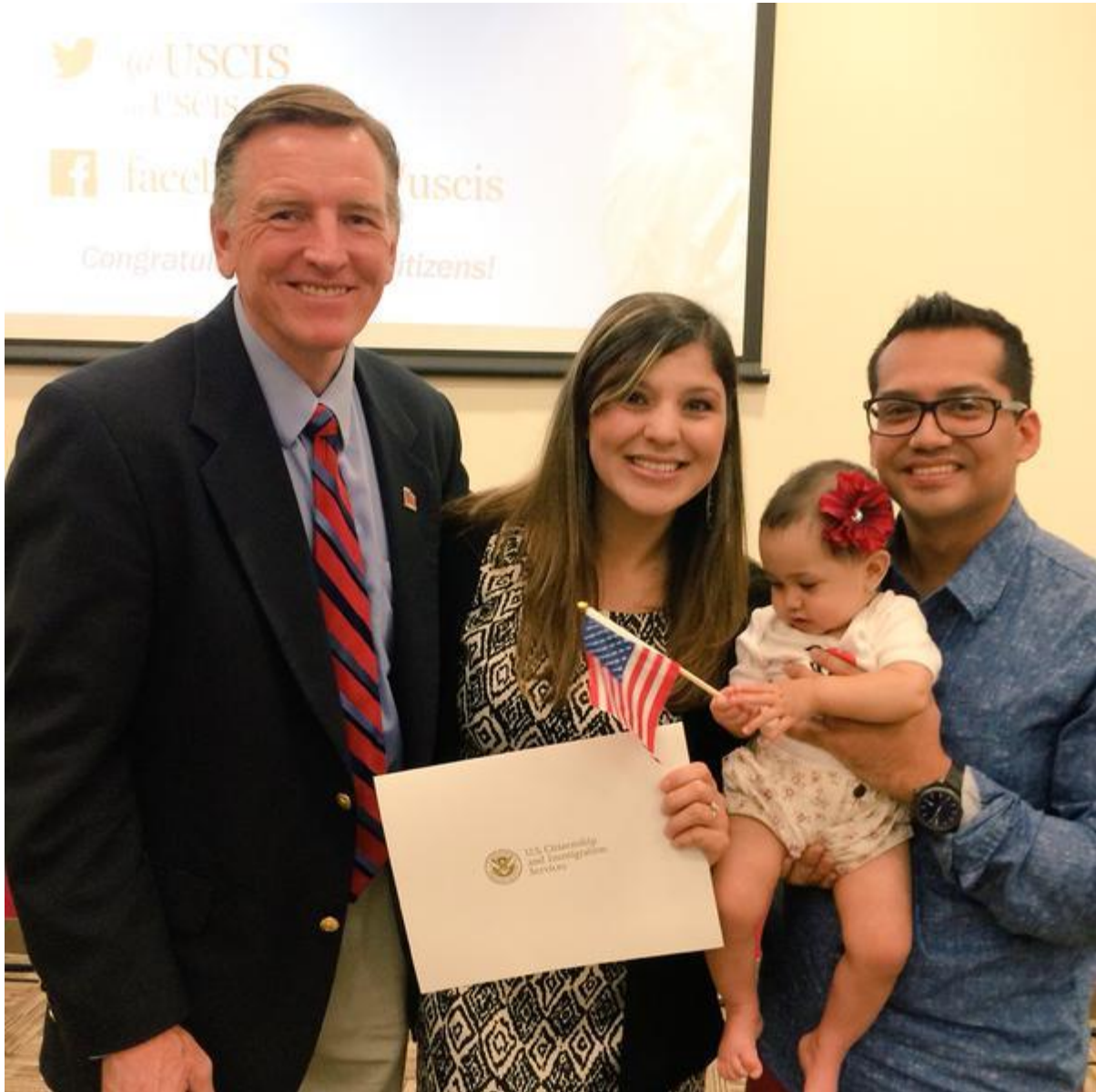
Celebrating with the Bermudez family at the August 11th naturalization ceremony in Phoenix.