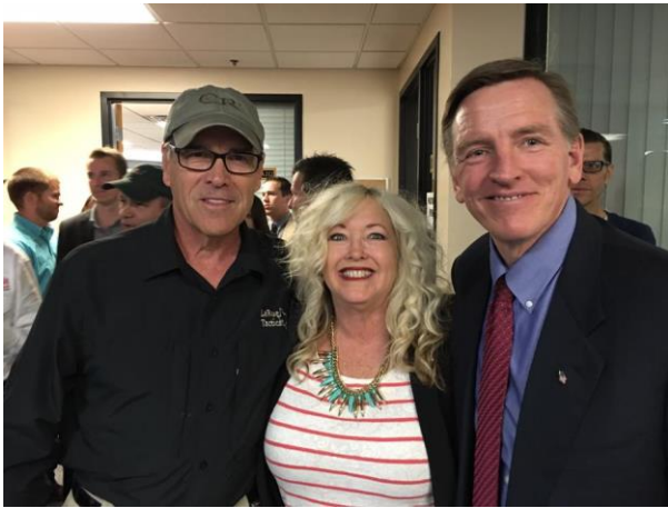
Had a great meeting this week with Canadian Parliamentarians from the Inter-