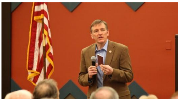
(Rep. Gosar holds up his copy of the Constitution)

I did however vote in favor of amendments to improve this bill's adherence to the Constitution.