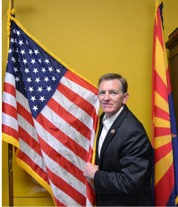
(Rep. Gosar stands with the U.S. flag in his Washington, D.C. Office on Flag Day, July 14, 2013)

On June 14, 1777, the Continental Congress passed an official resolution stating, “that the flag of the United States be 13 stripes alternate red and white; that the Union be 13 stars, white in a blue field, representing a new constellation.” Please find more about the history of our flag in the Yuma Sun .