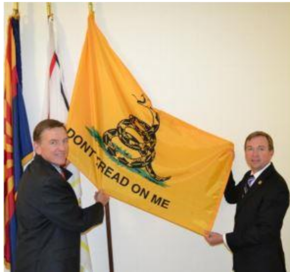
(Reps. Gosar and Mulvaney pose with the Gadsden Flag outside Rep. Gosar's office in Washington, D.C., May 10, 2013)

Congressman Mick Mulvaney (SC-05) and I will hold a joint town hall, focused on the economy, in Prescott, Arizona on Monday, June 24.