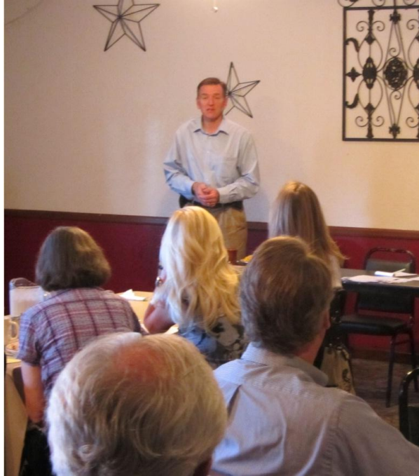
Congressman Gosar at one of his "Stop the Tax Hike" events from this summer.

This summer, I voted for the Job Protection and Recession Prevention Act of 2012 (H.R. 8), legislation to protect America's small businesses and families by extending the current Bush tax cuts for one year. Had the Senate not failed to act, we could have effectively stopped the tax hike.