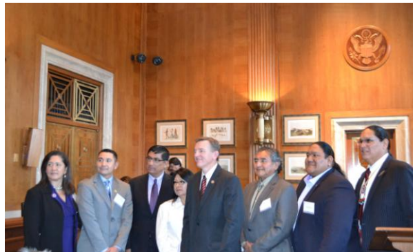
Congressman Gosar with local leaders at the National Indian Gaming Association Tribal Leaders meeting on December 4th.

This week, I met and spoke with tribal leaders on Capitol Hill. I have strongly maintained the federal government's treaty obligations to Native Americans, and I have been a proponent of true tribal sovereignty.