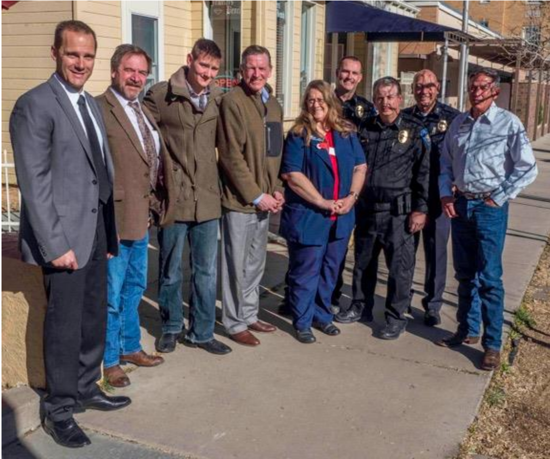
Had a great town hall in Payson on Wednesday night where I focused on the federal budget and cutting wasteful spending.