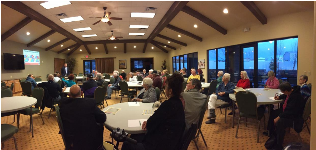
Another good turnout in Apache Junction discussing the issues of the day with concerned citizens.