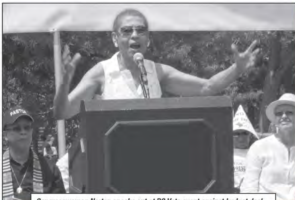
Congresswoman Norton speaks out at DC Vote event against budget deal