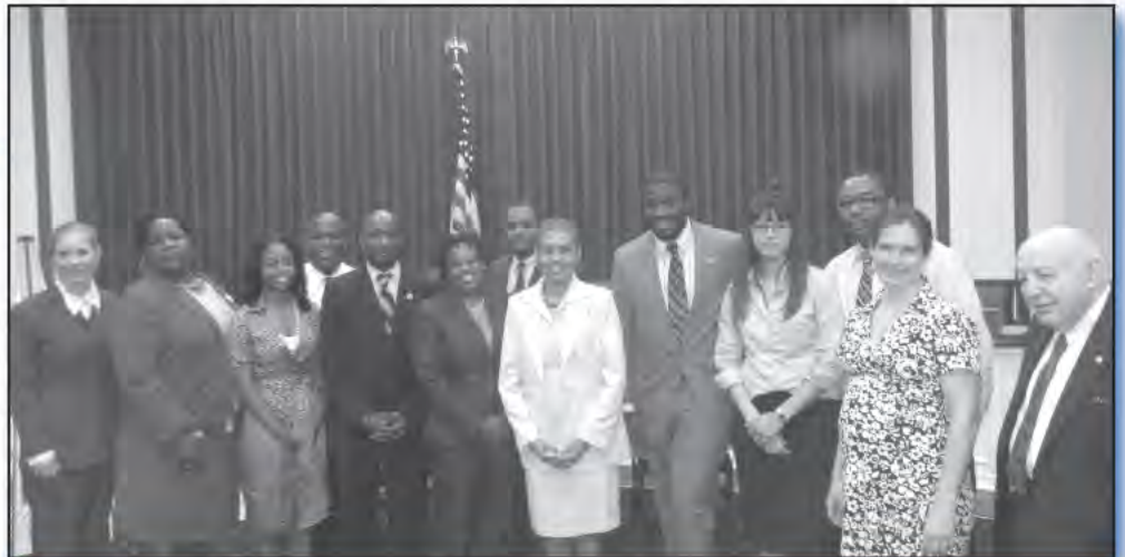
Norton with some of the ANC Commissioners who attended her Annual ANC Meet and Greet and Information Session on the Hill

"Resolved, That the House of Representatives supports the designation of the last Saturday in July as National Dance Day to celebrate our commitment to dance and physical fitness across the United States" - From Norton's National Dance Day Resolution