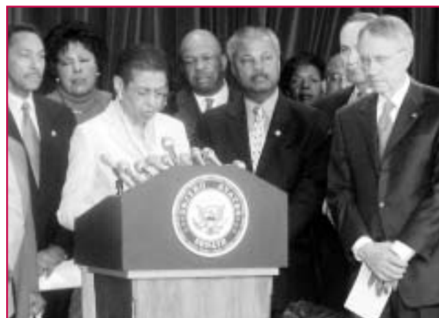
Norton speaks at a Senate news conference about her opposition to the judicial nominations with Black Members and Senate Minority Leader Harry Reid.

A s Congressional Black Caucus Chair for Judicial Nominations, Norton led the CBC effort in Congress against California Supreme Court Justice Janice Rogers Brown and former Alabama Attorney General William Pryor. She said that these two were “wholly unacceptable because of their records on racial and ethnic discrimination and on federal laws and federal court rulings that have been responsible for the progress of Blacks and Hispanics in our country.” Justice Brown has rejected the civil rights remedies Congress has enacted and the courts have approved. Judge Pryor has been the country’s leading opponent of the 1965 Voting Rights Act.