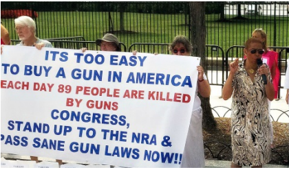
NORTON SAVES D.C. GUN LAWS – PAGE 4