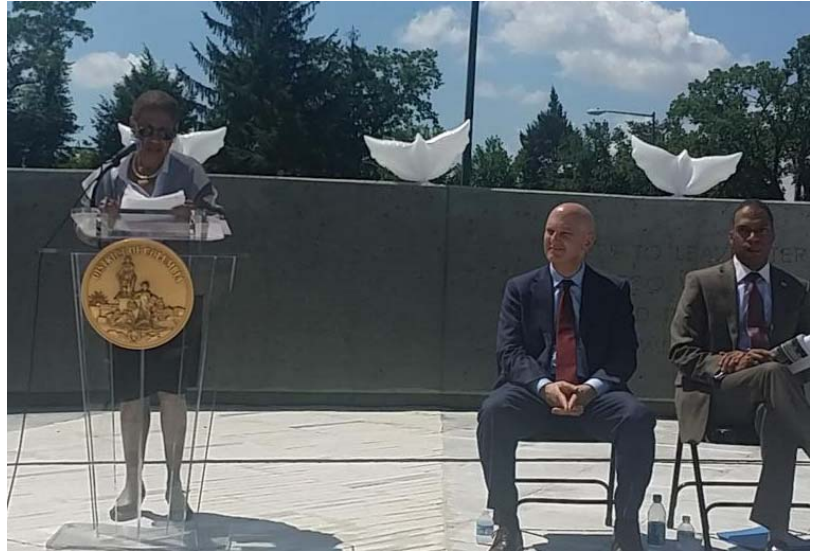
Pictured: Norton dedicates Legacy Memorial Park, a new memorial to honor the nine D.C.-area residents killed in the tragic 2009 Red Line crash

Norton reintroduces bill to restore parity between commuter transit and parking benefits