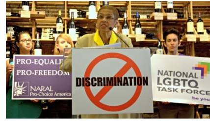
NORTON PREVENTS D.C. ANTI-DISCRIMINATION LAWS FROM BEING OVERTURNED—PAGE 4