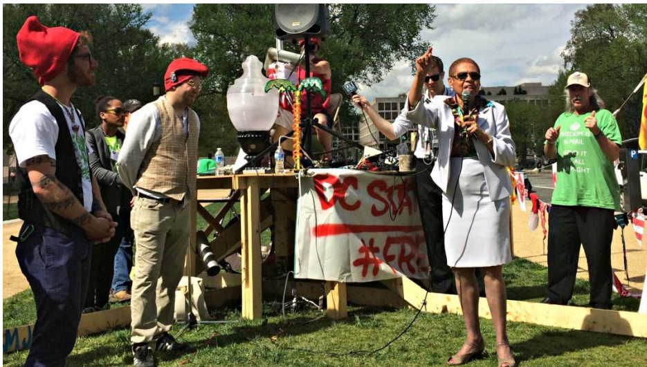
Norton rallying for D.C. statehood with Liberty Pole Activists on National Mall

D.C. STATEHOOD GETS HISTORIC NATIONAL ATTENTION ON HBO — PAGE 3