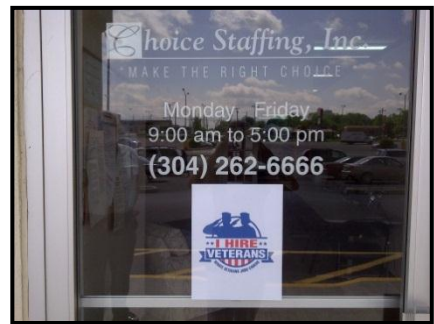
Choice Staffing, Inc. proudly displays the “I Hire Veterans” logo in Martinsburg, WV

Democrats and Republicans have joined together to form the Congressional Veterans Jobs Caucus and launch the “I Hire Veterans” initiative. The caucus is led by Sens. Joe Manchin III (D-WV) and Mark Kirk (R-IL), along with Rep. Jeff Denham (R-CA) and Rep. Tim Walz (D-MN). They ask their colleagues and private businesses to make a personal and public commitment to hiring veterans by displaying the “I Hire Veterans” logo.