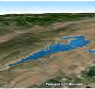
Proposed Sites Reservoir

Water storage south of the Delta is possible and necessary. The combined capacity of the great Delta pumps near Tracy is 15,000 cubic feet per second. They do not operate year round, only when there is sufficient water in the Delta, when threatened fish are not near the pumps, and when there is agricultural and urban demand south of the Tracy pumps. Currently, there is very limited water storage capacity south of the Delta. We must build more. San Luis and Los Vaqueros reservoirs should be expanded. New dams could be built at Los Banos Grandes, and numerous smaller off stream sites throughout the San Joaquin Valley. There are many aquifers throughout the San Joaquin Valley that may prove suitable to store additional water that would be used in a conjunctive use water management system. With these water storage facilities in place, the need for havoc causing excessive pumping in the Delta could be avoided.