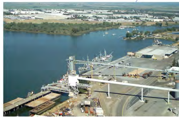
(PORT OF SACRAMENTO)