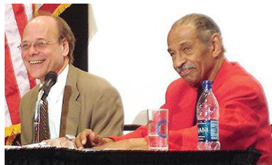
Congressman Cohen and House Judiciary Chairman John Conyers field questions from District 9 constituents during the February Town Hall Meeting at the National Civil Rights Museum.

A true representative democracy exists when citizens communicate with their government representatives. My office can always be contacted via email, phone, and fax; one of my highest priorities throughout the 110th Congress is staying in direct contact with you. As you read the rest of this brochure, please note the services the 9th District offices are able to provide to you, both from Memphis and from Washington.