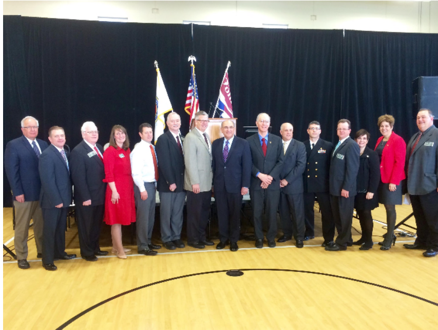
(Rep. Hultgren with local Will County leaders)