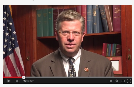
(Click picture to watch video)

Please watch my video below for more information.