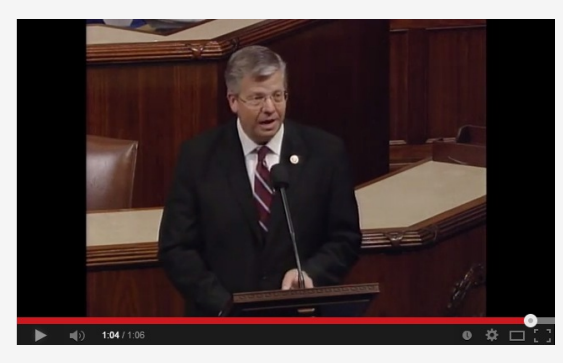
(Click picture to watch video)

Here's a floor speech I gave on the USA Science and Engineering Festival in Washington, D.C. which energized students and teachers and showcased the opportunities of the future.