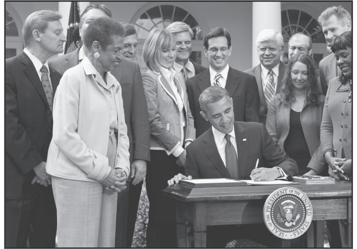
Norton at White House signing of small business jobs bill

New national poll shows that more than 70% of Democrats and Republicans support budget autonomy...Pg 2