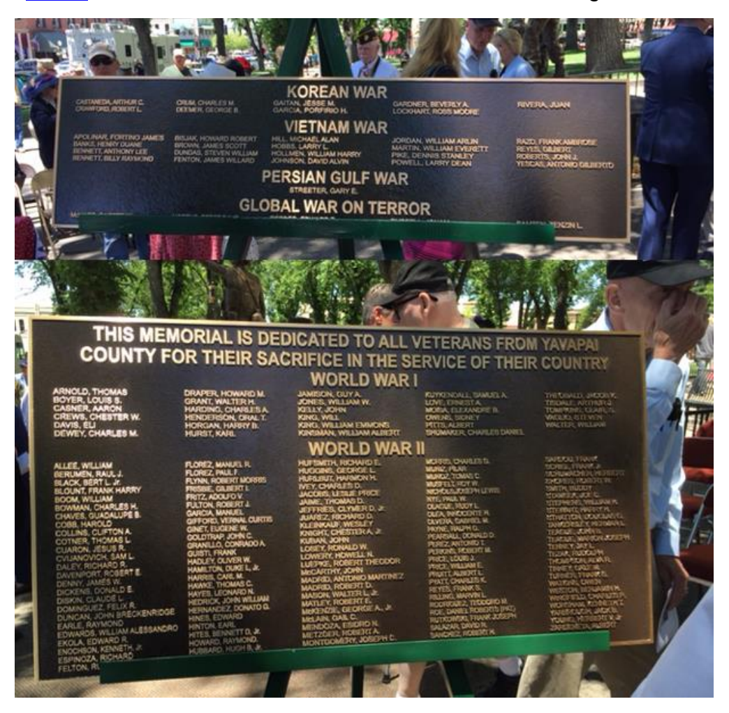
Happy 241st birthday to the greatest fighting force in the history of the world...the United States Army!

Last Tuesday, my Prescott staff attended the Yavapai Veterans Memorial Plaque Ceremony where 32 new names of Yavapai County residents who gave their lives serving our country were added. Now, these heroes' names will never be forgotten. Click<u>HERE</u> to learn more about the individual stories of these great Arizonans.